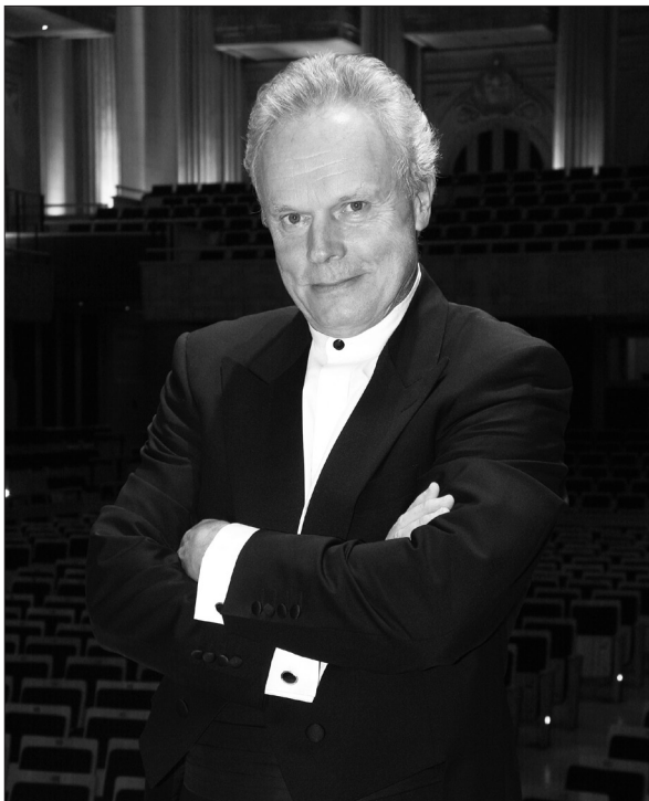
Yan Pascal Tortelier