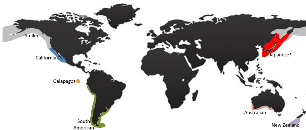
Figure C-1: Approximate breeding distribution of sea lion species. *Japanese sea lion likely became extinct in the 1950s.