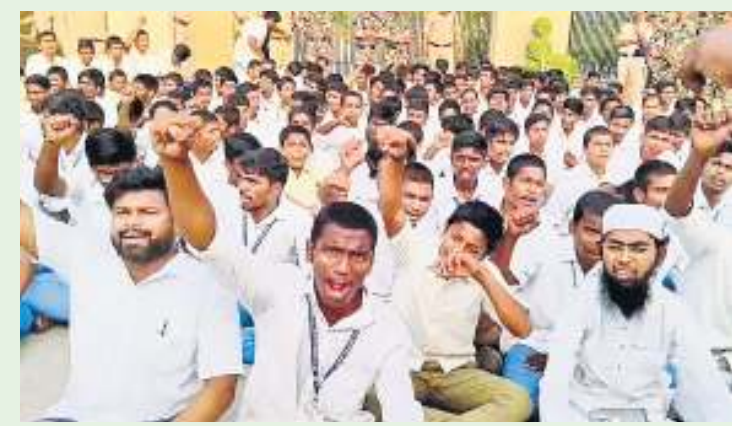
Beechupally Gurukul Boys' Government School students during their sit-in outside the Collectorate in Gadwal on Wednesday

This shift to tobacco farming is a practical solution to the challenges posed by wild animal interference while offering farmers a more rewarding and sustainable income.