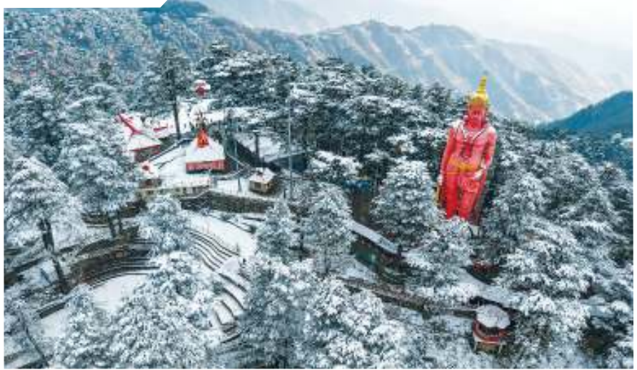
The Jakhu Temple and its premises covered with snow after fresh snowfall, in Shimla