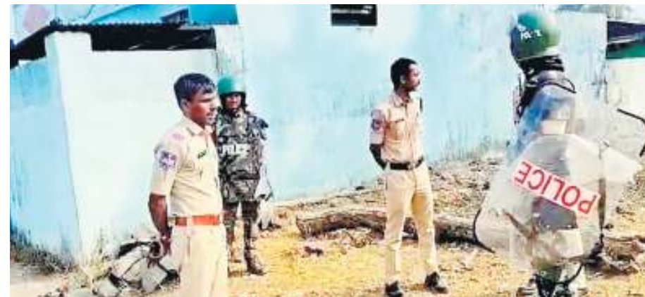
Police conducting patrol at Gudihathinur village in Adilabad district

Recently, at Gudihathinur in Adilabad district, a young man, under the influence of alcohol, attempted to sexually assault a minor girl. The family members and locals protested, beat up the suspect, and set his house on