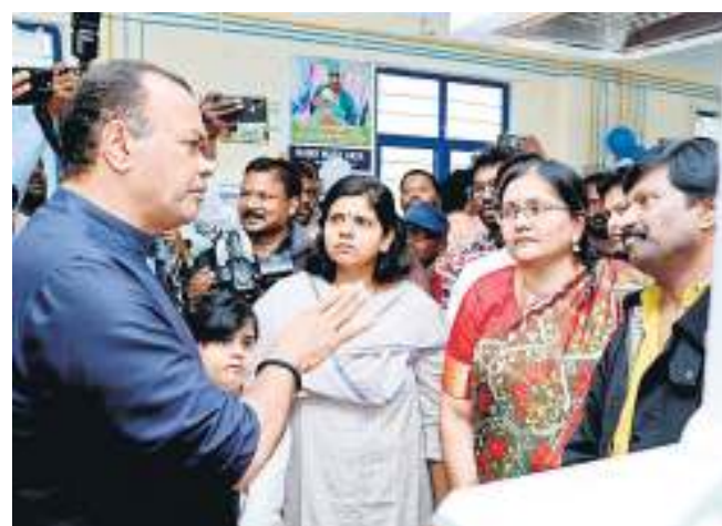
Roads and Buildings Minister Komatireddy Venkat Reddy inspecting the advanced medical equipment at the Government Hospital in Nalgonda on Wednesday

He explained that with the new equipment, conditions such as jaun-