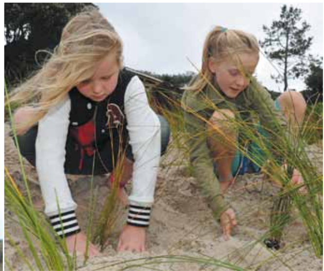
A planting trial of wiwi (below) being established on bare sand of a backdune to replace dense exotic species recently removed, Papamoa Beach, Bay of Plenty.

Rather than planting scattered plants over a wide area, wiwi is typically planted quite densely (e.g. seedling spacing of 50 cm or less) – either in small groups or over larger areas. It is also commonly planted in companion with other woody species, particularly ground cover scramblers such as pohuehue ( Muehlenbeckia complexa ) and where it occurs, sand coprosma ( Coprosma acerosa ). Whether planted in small groups or over larger areas, dense colonies are commonly achieved within 1-2 years depending on plant spacing and companion planting.