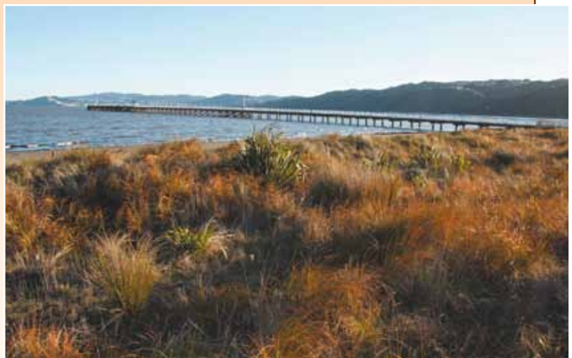
Wiwi was one of the most successful backdune species in a backdune planting trial on the exposed harbour site at Petone, Wellington.

In this trial wiwi were planted in small groups of eight plants with plants spaced about 50 cm apart. The vegetative spread of rhizomes resulted in the merger of plants to form a dense cluster (nearly 70 cm average lateral plant spread 5 years after planting). Plants are healthy and flowering and seeding despite the severe exposure of this backdune site.