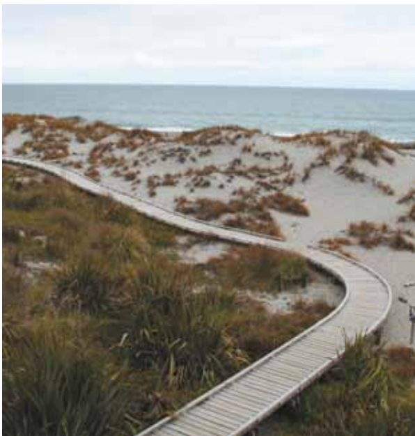
Wivi is one of the few hardy native plants regenerating on backdunes throughout New Zealand.

Wivi is often amongst the few coastal native species to first colonise disturbed or newly established dune sites following initial stabilisation by the native sand binding species spinifex and pingao. With increasing sand stability wivi becomes established on backdune sites either as natural regeneration from nearby seed sources or from plantings, thus testifying to its adaptability as an early successional plant on a wide range of landward semi-stable dune sites.