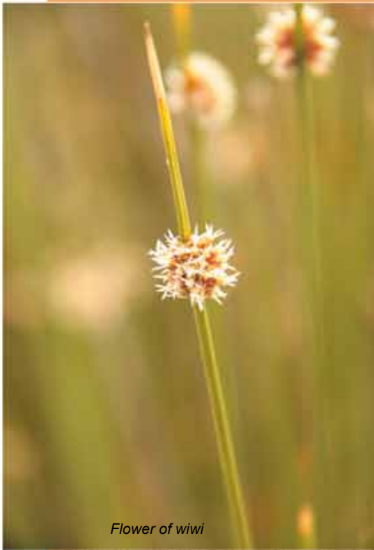
Flower of wiwi

The flower has a dense rounded form 7-20 mm in diameter forming a few centimetres below the end of the sharp pointed leaf which protrudes past the flower head. Each flower develops into a knobby brown seedhead containing many dark brown to almost black nuts each about 1 mm in size. The white flowers of wiwi appear from September to December and fruits appear from November to May. The distinctive seedhead persists on many stems making the plant easy to recognise throughout the year.