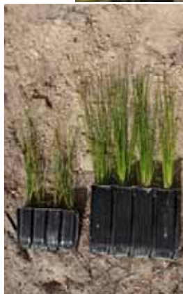
Wivi are easily raised in a range of container types and sizes within one year of sowing seed.