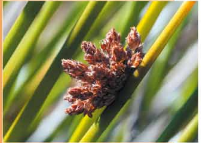
Seedhead of wiwi and hence its name knobby club rush.

Wiwi is a perennial rush forming clumps of dark green stems on long creeping rhizomes. It grows to between 30 and 90 cm in height depending on the degree of exposure. The stems are cylindrical usually with a slight tapering at both ends, smooth-surfaced and approximately 1.5-3 mm thick.