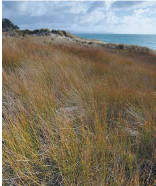
Wivi often forms extensive dense stands on backdunes in many regions throughout the country.

Wivi occurs as scattered individual plants in mixture with other ground cover native species or can form extensive dense stands on sand dunes and around estuaries.