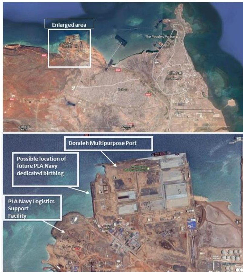
Figure 3. China's naval facility in Djibouti

Most of China's military logistics facilities in Djibouti are being built immediately southwest of the Doraleh Multipurpose Port (see Figure 3), although the PLA Navy will have one of the port berths dedicated exclusively for its use. It is expected to be completed in 2017, though the Chinese government has not officially provided any figures on the number of personnel that will be stationed there. The base is also unofficially reported to include storage for fuel, weapons, and equipment, and maintenance facilities for helicopters and for commercial and military ships. 98