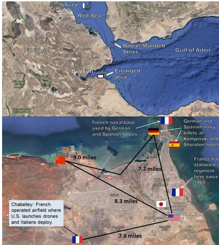
Figure 4. Foreign military facilities in Djibouti

See Appendix B for sources used to determine base locations.