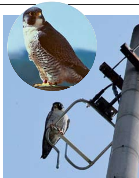
Erie, the Cathedral of Learning's male peregrine falcon