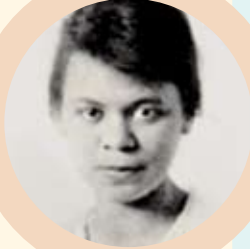
Virginia Proctor Powell Florence

1919 Virginia Proctor Powell Florence is the first African American woman in the United States to complete a professional education program in librarianship. She graduates in 1923 from the Carnegie Library School, which later became part of Pitt's School of Information Sciences. (In 2004, a plaque honoring Florence is installed in the Information Sciences Building lobby.)