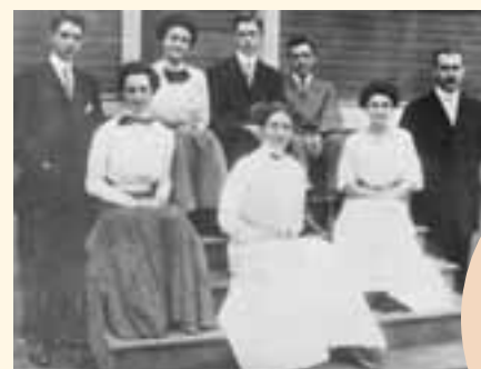
First graduating class from the School of Education

1908 Pi Theta Nu , the first sorority, forms in 1908. Women's organizations are rare until after 1910.