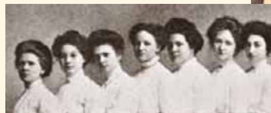
Pi Theta Nu, 1909