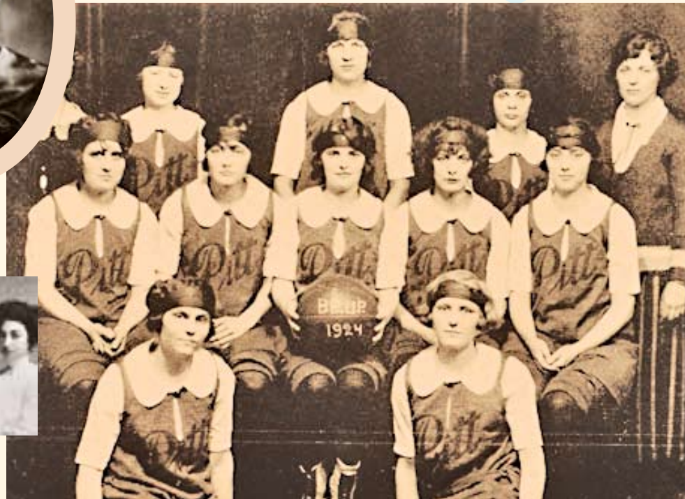
Pitt's 1924 women's basketball team

1914-15 Women's basketball organizes, the first competitive sport for women at Pitt. (For an update on the Pitt women's basketball team, see p. 6.)