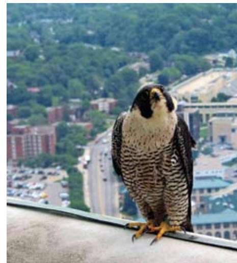
Dorothy, the Cathedral of Learning's female peregrine falcon