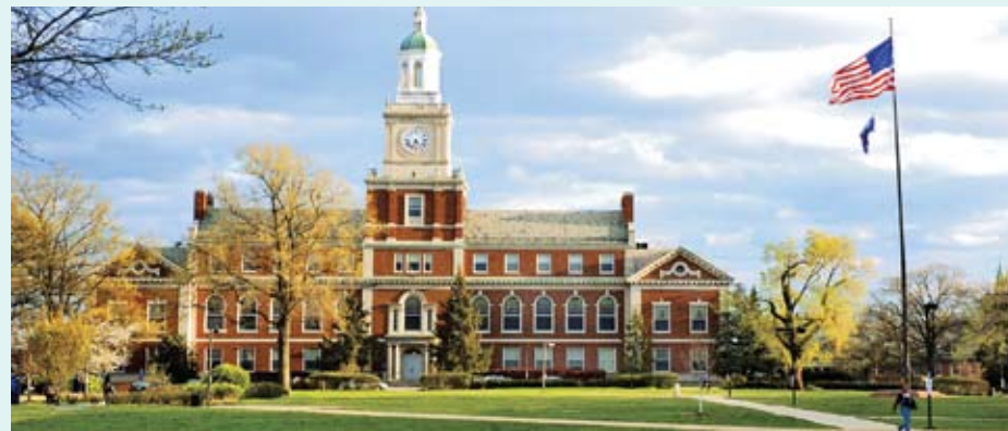
Founders Library on the campus of Howard University