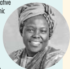
Wangari Muta Maathai

2004 Wangari Muta Maathai , who earned the Master of Science degree in biology at Pitt in 1965, is awarded the Nobel Peace Prize for her 30-year effort to reforest her native Kenya and improve the economic status of women there, while fighting for democracy and against corruption and tribalism. Pitt conferred on Maathai an honorary Doctor of Public Service degree during an Oct. 26, 2006, ceremony in Alumni Hall.