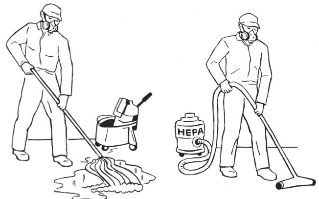
Wet mop or HEPA vac and wear a respirator