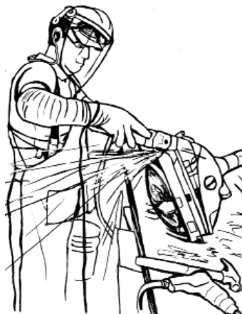
Face shield worn over safety glasses