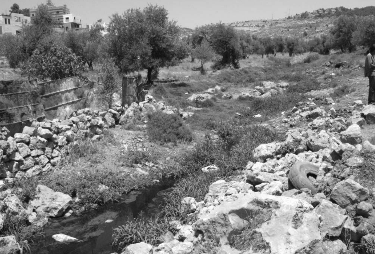
Wastewater of Ariel and Salfit flowing within the village of Brukin

that crops and water sources of 70 Palestinian villages near settlements had been contaminated. 98 An investigation by the State Comptroller in 1991 found that wastewater from six settlements endangered the quality of nearby water drillings, and that the raw wastewater of five other settlements flowed onto cultivated Palestinian land, damaging crops. The names of the settlements were not given. 99