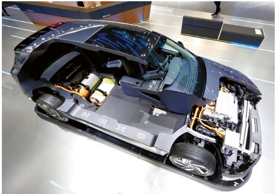
Hyundai Nexo, the first cheaper car (under 60,000 euros) with fuel cell-powered electric drive (FCEV); the company will provide information on the background and plans for mass production at the elect!; the falling prices of lithium-ion batteries as well as the increasing driving range of battery-electric vehicles (BEV) are a cause for discussion