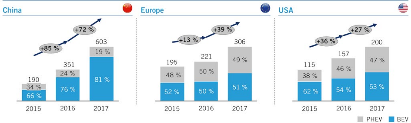
China once again outperformed European and US markets in 2017: electric vehicle sales (BEV, PHEV) up 72% to 603,000 units, nearly half of the world market (quantities in thousands)

Representatives of the Meet Battery Research Center and the P3 Group will