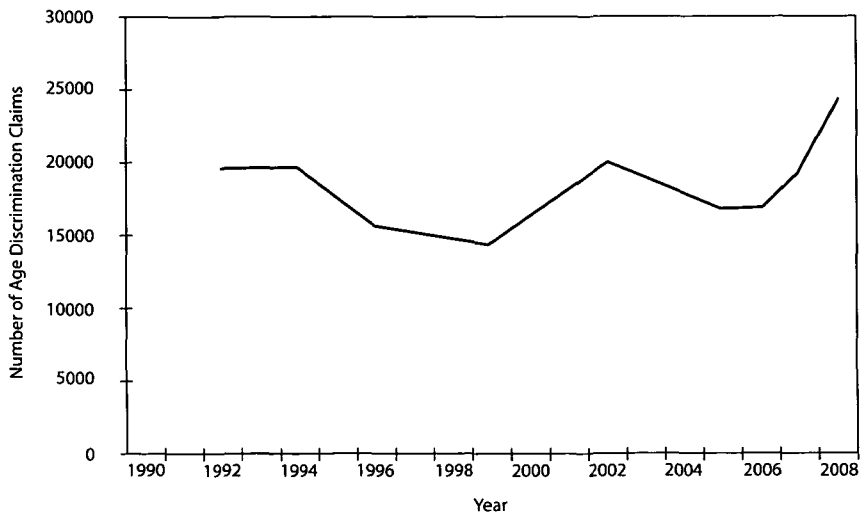
Figure 1. Number of Age Discrimination Claims: 1990 - 2008