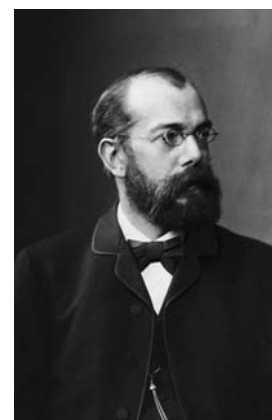
Robert (Heinrich Hermann Robert) Koch, elected 1901, FHM.