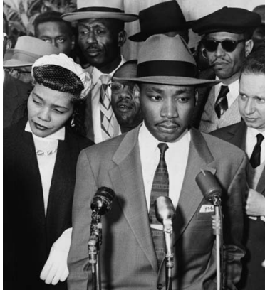
Martin Luther King, Jr., elected 1966.