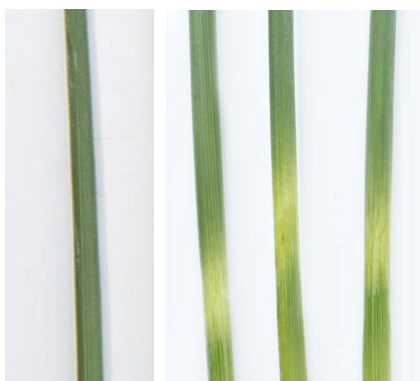
Grain Filling Z60 – 75 — Stem frost Healthy stem on the left