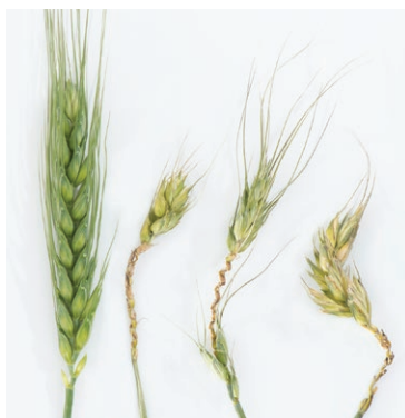
Head Emergence Z49 – 60 Healthy head on the left

Symptoms are different depending on the time of the frost event