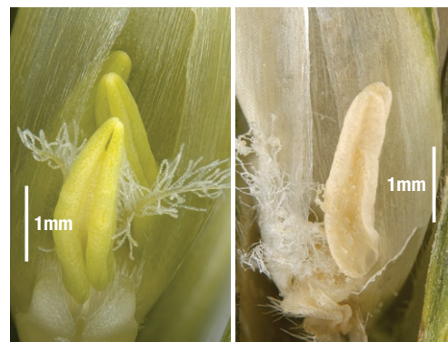
Flowering — Anther and Ovary Z65 Healthy anthers and ovaries on the left