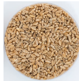
Grain Filling Z75 – 85 — Harvested grain Healthy grain top image