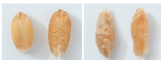
Grain Filling Z75 – 85 — Harvested grain Healthy grain on the left