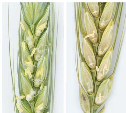
Flowering Z65 Healthy head on the left