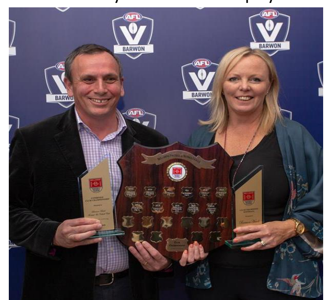
Overall Club Champion Torquay