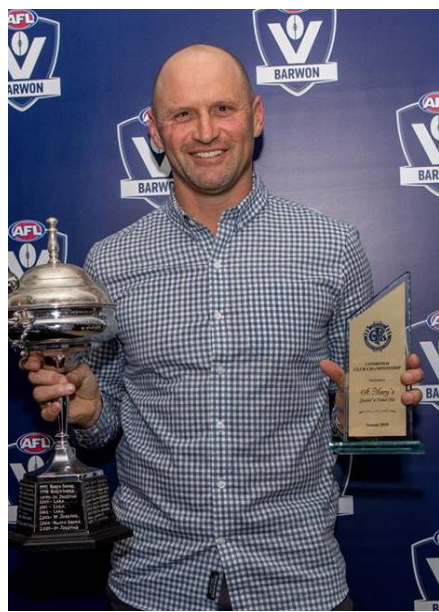
Overall Club Champion St Marys