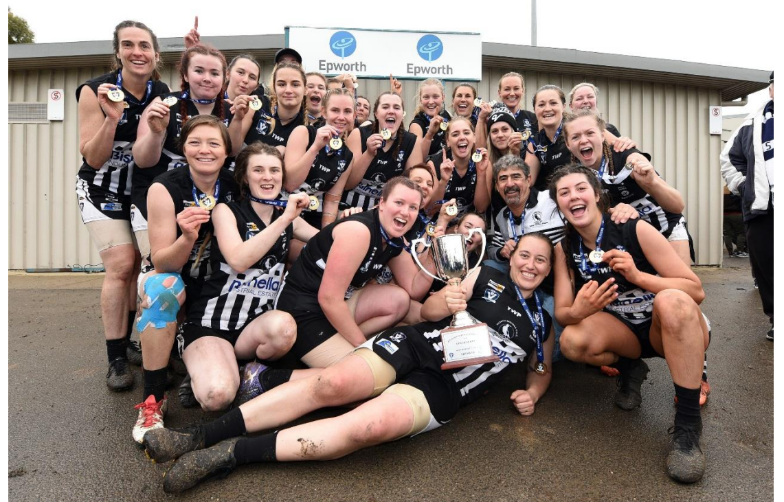
Senior Female Div 2 B&F