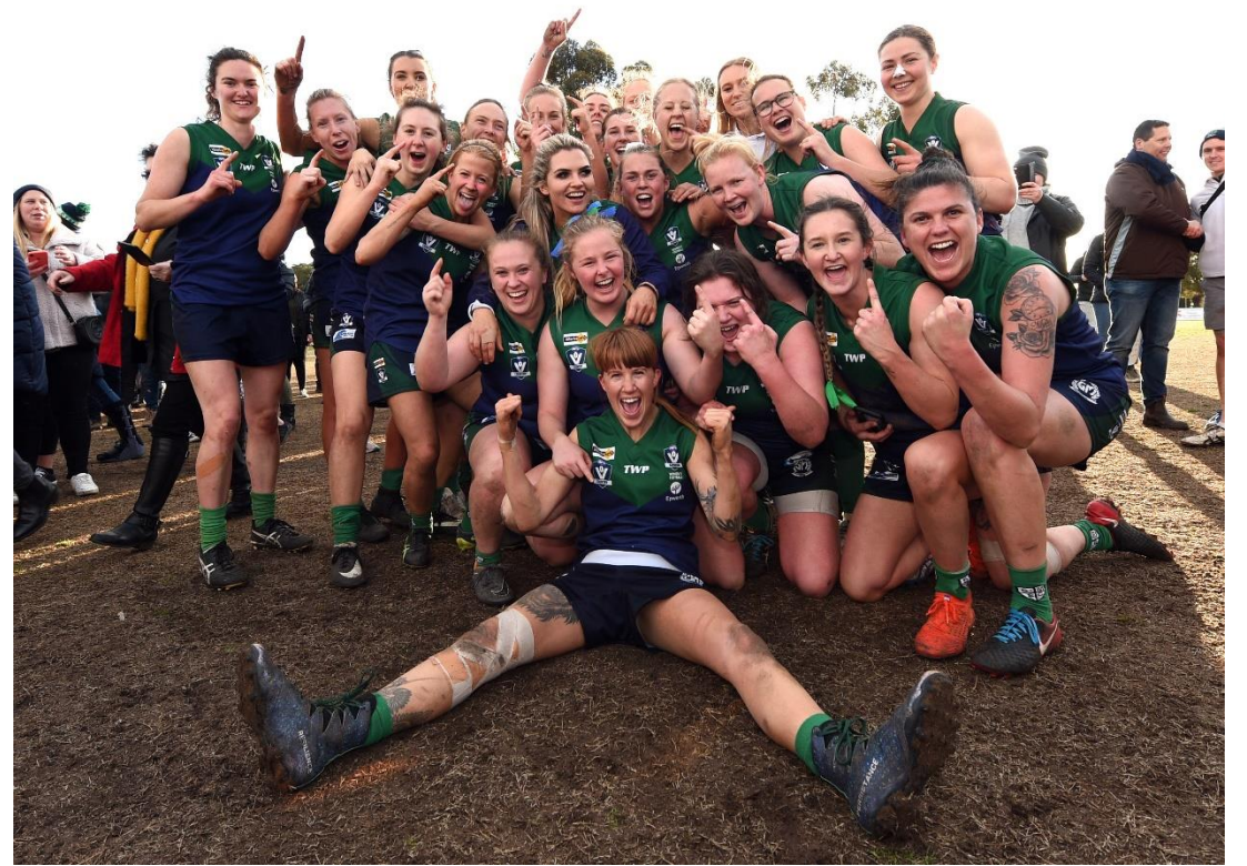
Senior Female Div 1 B&F