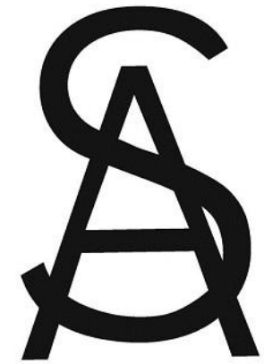
St Albans Football and Netball