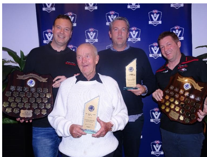
Overall Club Champion Newtown & Chilwell