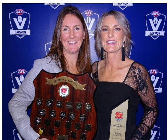
Overall Club Champion Torquay