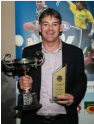
GFL Club Champion St Joseph's