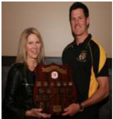
BFNL Club Champion Torquay