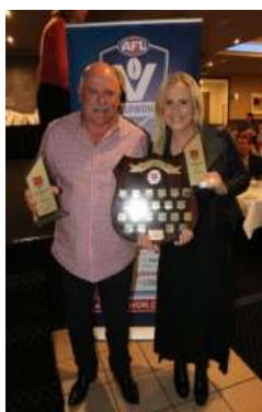
BFNL Club Champion Torquay