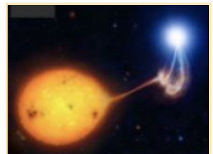
Artistic impression of an AM Her system (similar to V1500 Cygni ).

Due to evolution and the physics of the system, the Sun-like star loses mass in the direction of the primary companion. The matter does not fall directly onto the star, but rather forms a disk