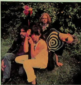
Blessed Ethel: a slice of Pixies-like raucousness

BLUE AEROPLANES: Broken & Mended (Beggars Banquet Primary BQ2 26). The Aeroplanes' first single for Beggars is a typically surging guitar fest that is probably their most commercial to date. ★★★