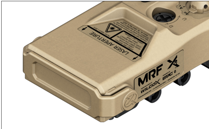
PRODUCT ILLUSTRATED WITH LASER SAFETY HOOD CLOSED