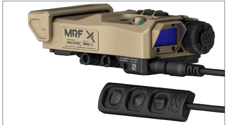
PRODUCT ILLUSTRATED WITH OPTIONAL LASER SAFETY VISOR** & INCLUDED ERGOCTO Xe SINGLE 3 BUTTON ACTIVATION KEYPAD - 20" CABLE