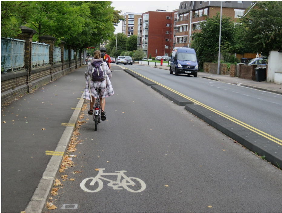
Figure 1: new cycle track, Kingston (Rachel Aldred)