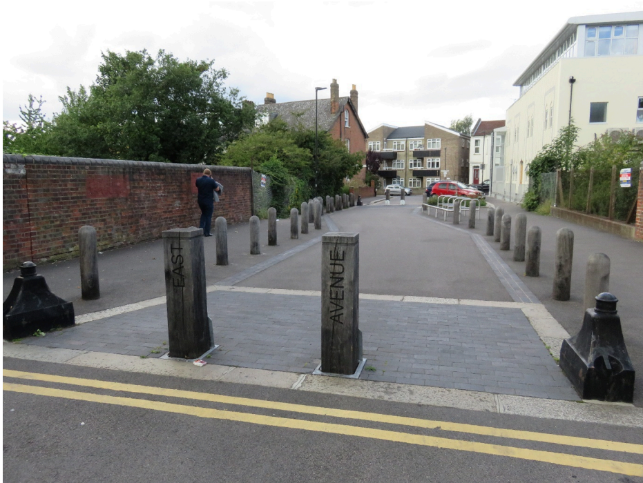
Figure 2: modal filter, Waltham Forest (Rachel Aldred)