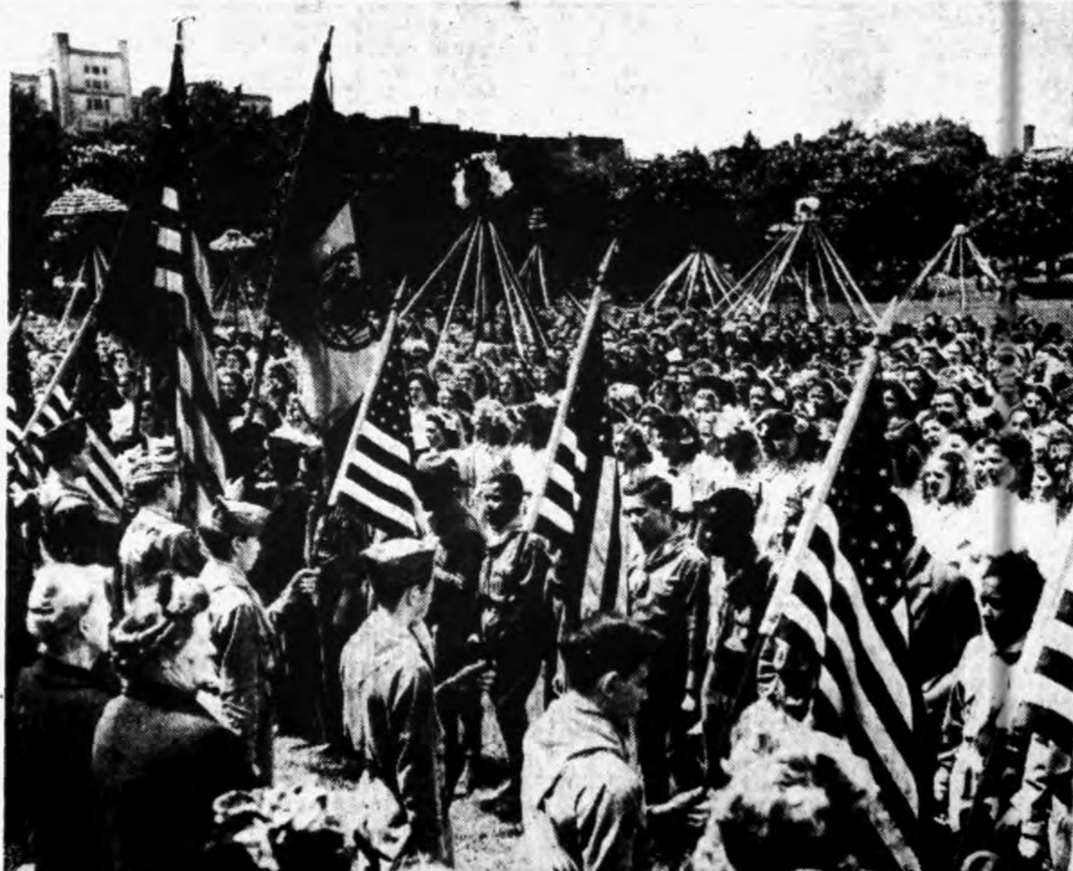
MAY CELEBRATION—A portion of the throng of boy scouts and school children who jammed King Park, Jamaica, yesterday for the 20th annual maypole and folk dance celebration...