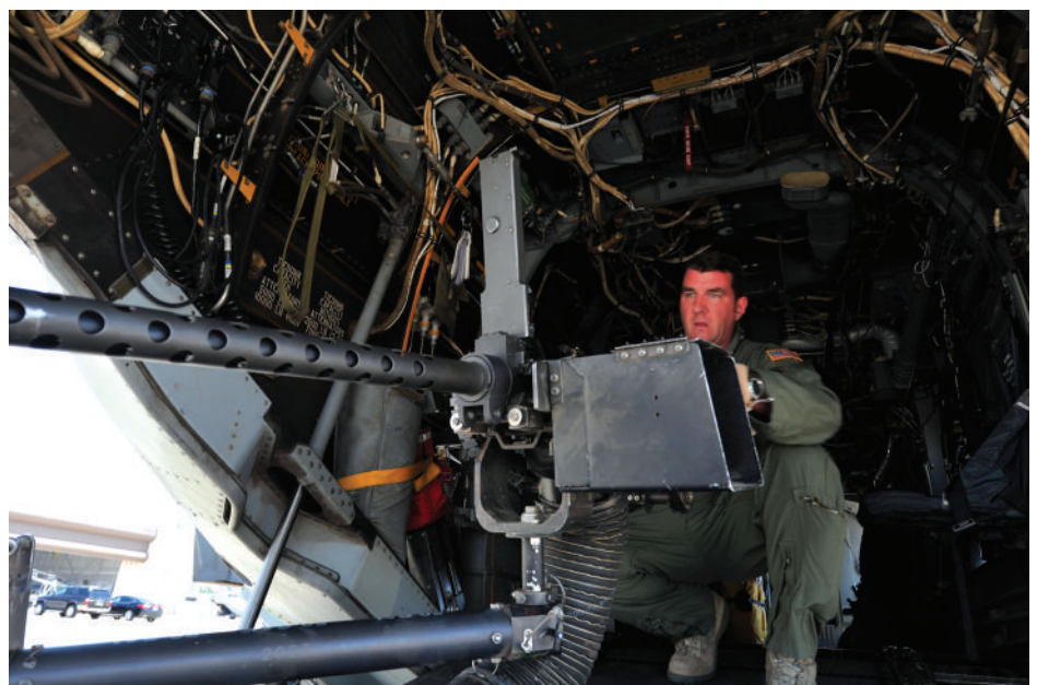
A member of the US Air Force 8 th Special Operations Squadron performs operations checks on a .50 caliber (12.7 mm) machine gun at Hurlburt Field, Florida in May 2014. The Marines use a 7.62 mm machine gun on the ramp that is often decried as inadequate by pundits.

Rivolo, a Vietnam War F-4 Phantom fighter pilot and Ph.D. physicist who also flew Air National Guard search and rescue helicopters with distinction in the 1970s, sees wisdom in the Navy’s decision to buy Ospreys to replace its aging Northrop Grumman C-2A Greyhound fixed-wing turboprop aircraft for carrier on board delivery (COD). Given that the V-22 can land on ships other than carriers, “The COD mission is a great mission for the V-22 –