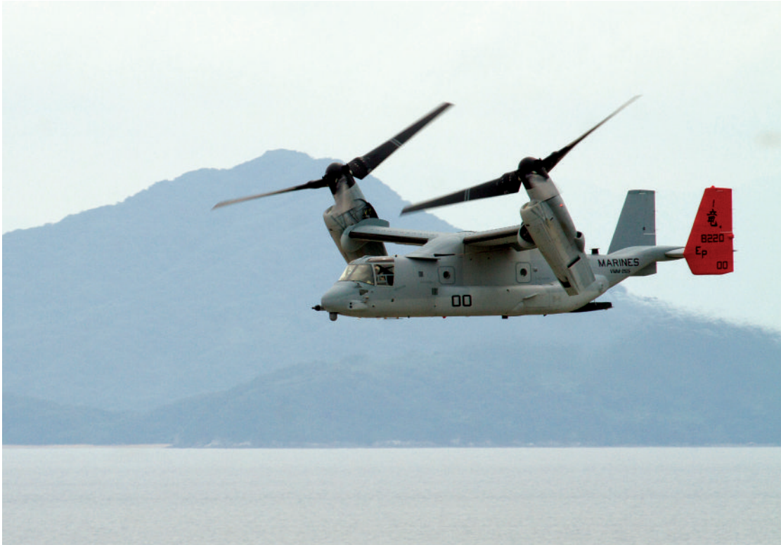
MV-22s operating out of Okinawa have been controversial with the local population, but Japan plans to purchase 17 Ospreys.