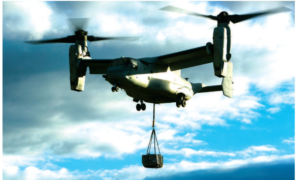
An MV-22 Osprey from SPMAGTF-CR-AF flies with a 2180 lb (1 t) pallet at Morón Air Base, Spain in January.

"If you're going to do combat assault, you have to be able to defeat the threat, and this airplane does not defeat the