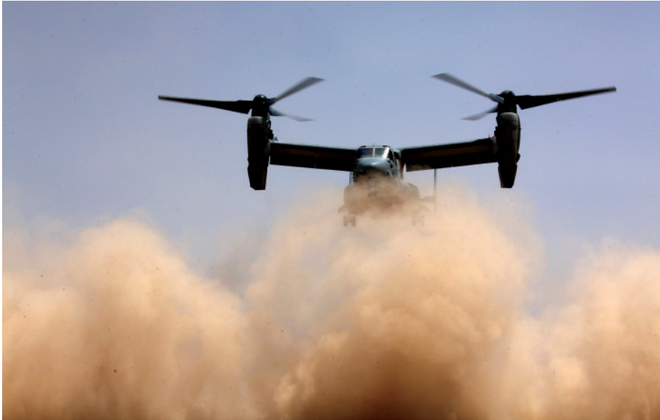
An MV-22B with VMM-365 lands in “brown out” conditions in Helmand Province, Afghanistan in July 2010. Dust and sand take their toll on engines, sometimes needing replacement after “just a few hundred hours.”

marines and others, meanwhile, have been carried into and out of combat safely, flying above insurgent small arms fire and potential ambushes, swooping down on objectives from above or from unexpected directions, and arriving with little warning thanks to the Osprey’s minimal forward acoustic signature in airplane mode. The Osprey has also helped save the lives of victims of natural disasters, from tsunamis in the Pacific to the Ebola crisis in West Africa.