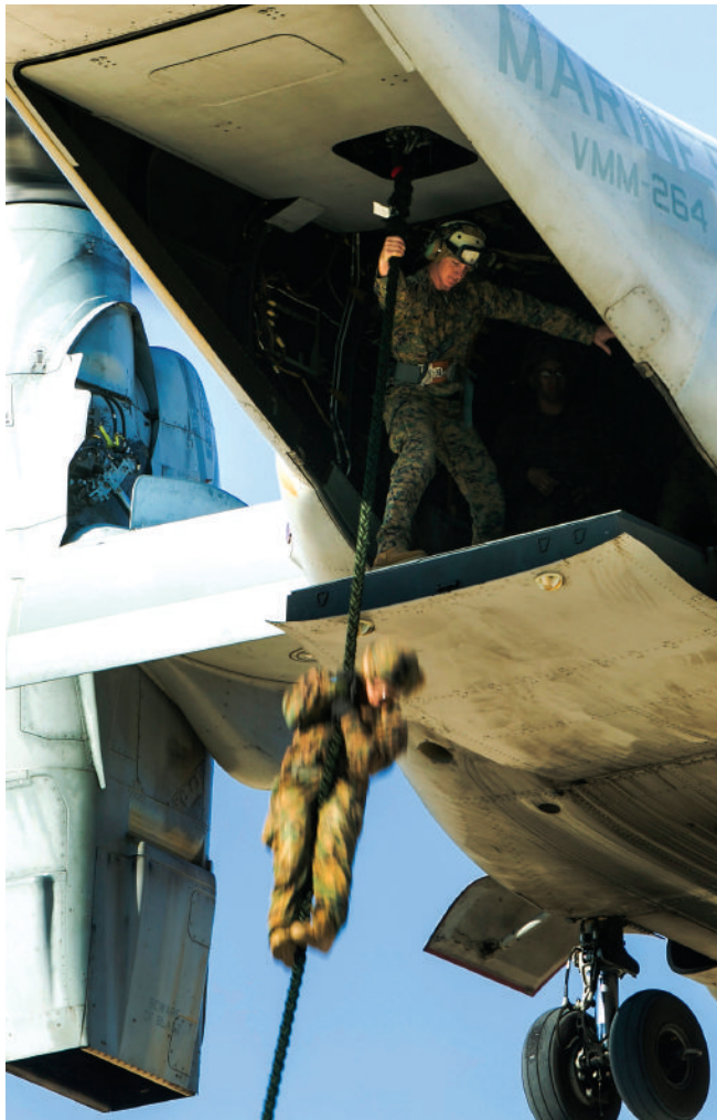
Marines practice fast-roping in Morón, Spain in January, from which four MV-22Bs deployed to Liberia in October 2014 for Ebola epidemic support operations.