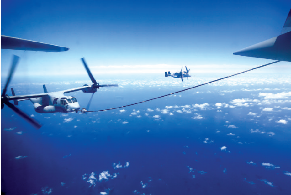
MV-22B Ospreys are refueled by a KC-130J off the coast of West Africa in May 2014 enroute to Ghana.

commander of Air Force Special Operations Command. "In fact, it's become the weapon of choice for a lot of our assaulters because it's fast and can get into some places much faster than a helicopter."