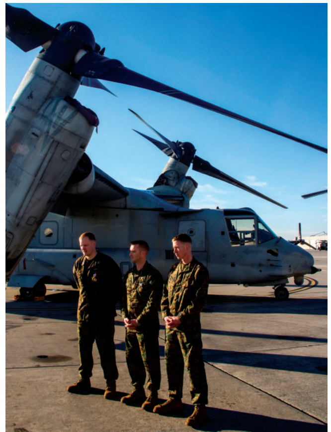
The pilot and flight crew of an MV-22B Osprey with VMM-266 Reinforced were honored in January 2013 for the rescue of a downed Air Force F-15E pilot in Libya in 2011.

Deputy Commandant Davis said one reason the Osprey is being used this way is that “we don’t have enough amphibious ships in the United States Navy. Without ships, I’m going to put a Special Purpose MAGTF in Morón, Spain, and another one in Kuwait, where we’re positioned to fly 2,000 miles [3,200 km] east or to Liberia, instead of parking an amphibious ship off the shore.”