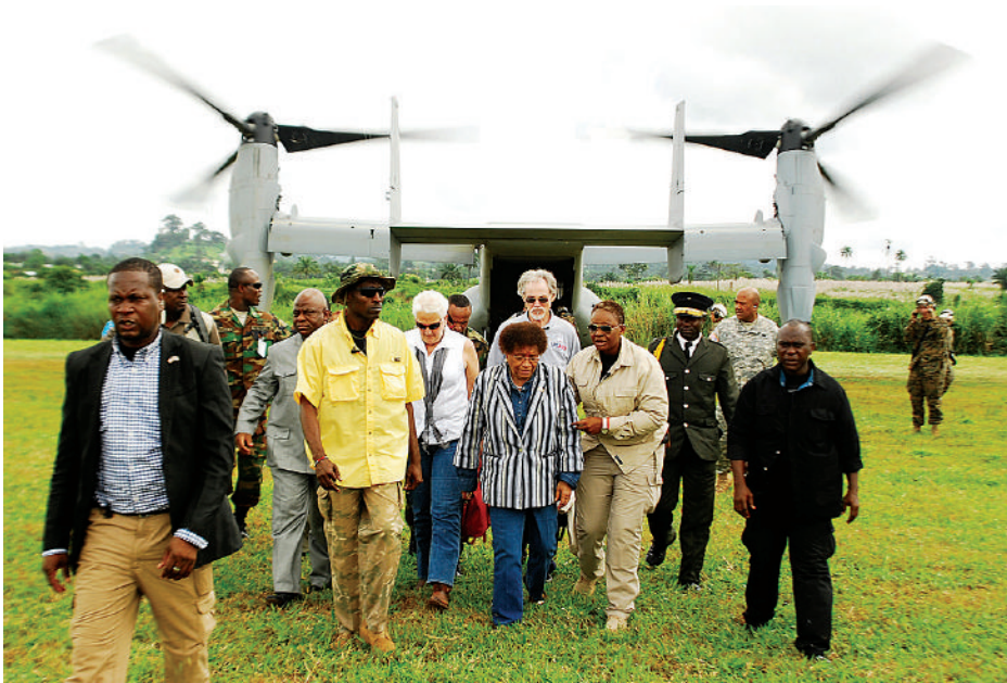
Liberia President Ellen Johnson Sirleaf (center with striped coat) visited remote Ebola-stricken areas of her country via an MV-22 Osprey in October 2014.