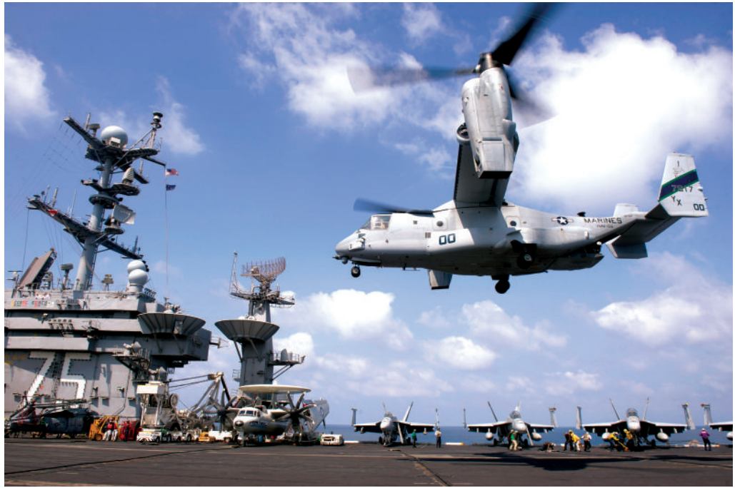
An MV-22 of VMM-166 lands on the USS Harry S. Truman (CVN 75) in October 2013. The US Navy now plans to purchase 44 Ospreys.

Keeping V-22s ready to fly has been such a stubborn problem for a number of reasons. One is the complexity of its design, which includes not only nacelles that move heavy engines and rotor assemblies, and all the wiring and tubing and fluids that go with them up and down, but also rotor blades that fold and a wing that swivels over the aircraft's back to fit below decks on an amphibious assault ship. Inaccurate estimates of how long parts would last have been another drag on readiness. Engineers simply failed to accurately anticipate the effects of flying the Osprey in sandy, dusty environments that rapidly wear out rotor blades and engines.