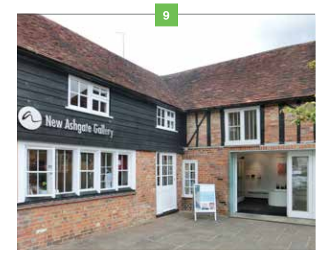
Lower Church Lane, New Ashgate Gallery

The gallery offering high quality art and craft work is by the entrance to the Waggon Yard car park. The building was restored by Farnham Building Preservation Trust in 1985. Further enhancements to the building in 2004 created the light, open space enjoyed by visitors today.