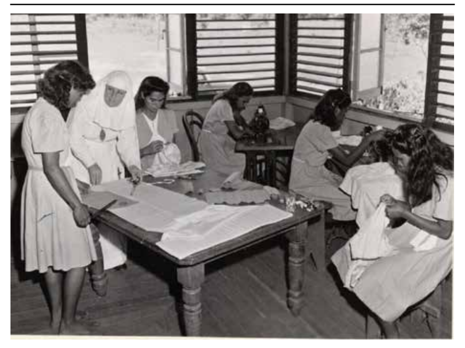
Dressmaking class at Roman Catholic mission, Garden Point, Melville Island 1958