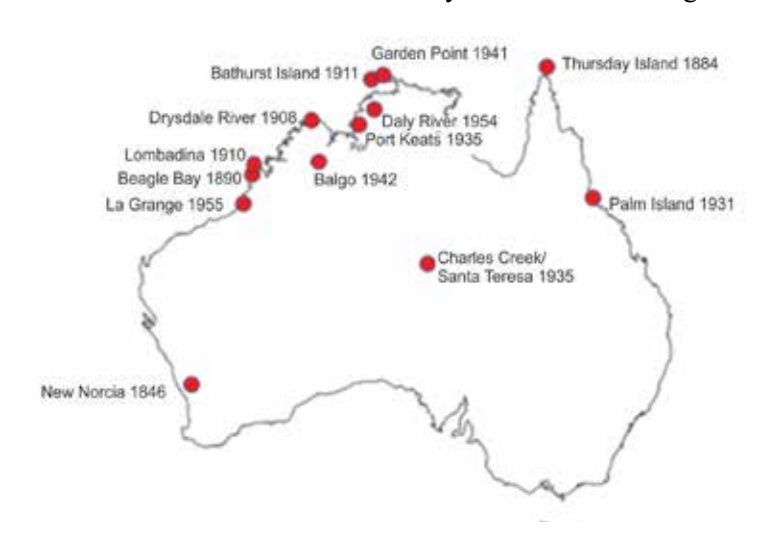
Fig 2 Catholic missions in Australia in the twentieth century

The missions in the twentieth century are indicated in Fig 2: