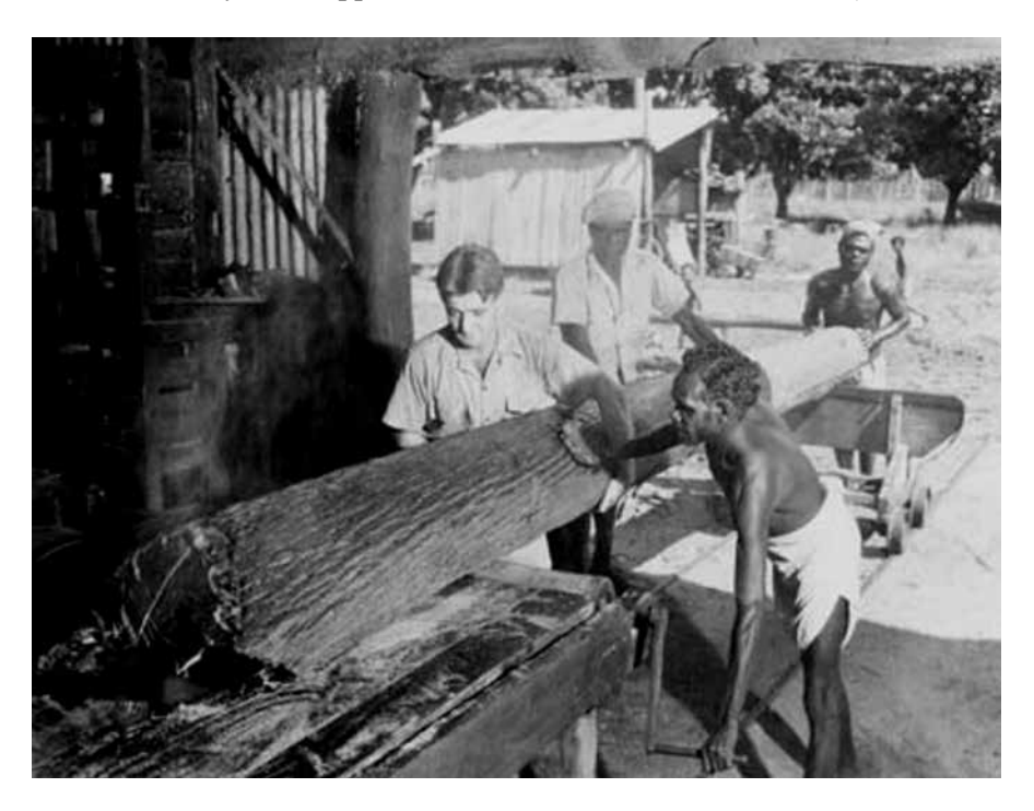
Bathurst Island mission sawmill, 1958 Australian Archives, image no. A1200, L25645

promised girls, all of them, according to tribal law, his wives. He became known as the "bishop with 150 wives". (Gsell 1955, p. 43; also recounted in Ritchie 1934, Pye 1977, pp. 41-2; a hostile view in Scanlon 1986)