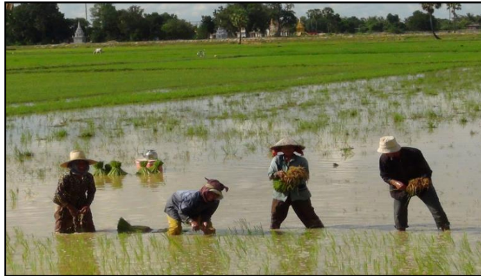
Rice fields in Cambodia