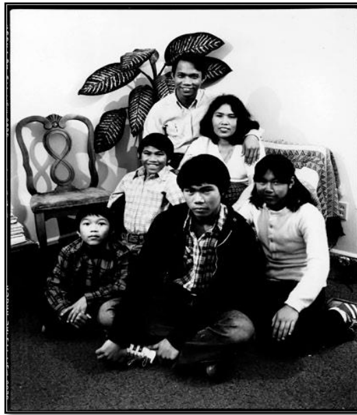
Dith Pran with his family

were later turned into an Academy Award-winning film titled 'The Killing Fields'. The title was the name given to the fields outside the infamous Tuol Sleng Prison ('S-21'), where thousands of people were imprisoned, tortured and executed.