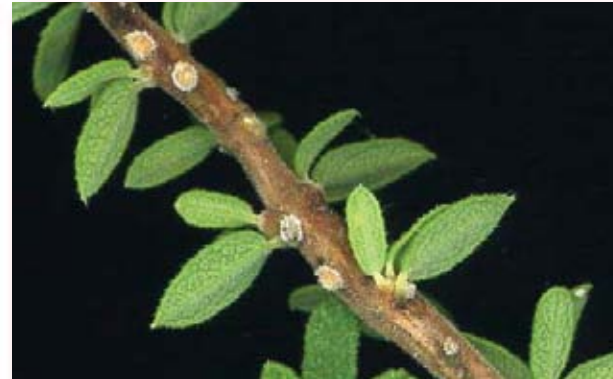
Scale on the underside of branch is infected with Asterolecanium (pit scale).

This is a tropical plant with excellent potential as a shohin bonsai. The trunk of Nashia inaguensis acquires an almost fluted, old look very quickly. Rootage at ground level is consistently abundant and adds to the aged appearance. It does not develop a trunk very