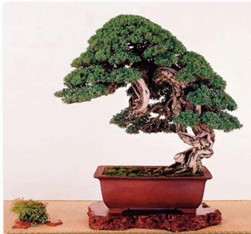
Pemphis acidula bonsai created by the author.

So, Pemphis acidula is able to withstand cold winter (at least in the subtropics) if proper cultivation is provided.