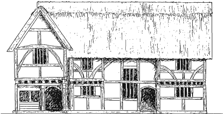
Godalming Museum buildings as they might have looked in the sixteenth century. The two-bay structure is on the left and the Wealden house on the right

The Wealden house was thought, on stylistic grounds, to date to about 1500, but the dendrochronological work has shown it to be older, to between Spring 1445 and Spring 1446, making it, at the time of writing, the oldest building in Godalming. Behind this bald statement, however, lies a mass of fascinating detailed work.