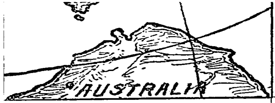
MAP SHOWING ROUTE OF MAWSON'S EXPEDITION AND AREA WHICH HE SOUGHT TO EXPLORE