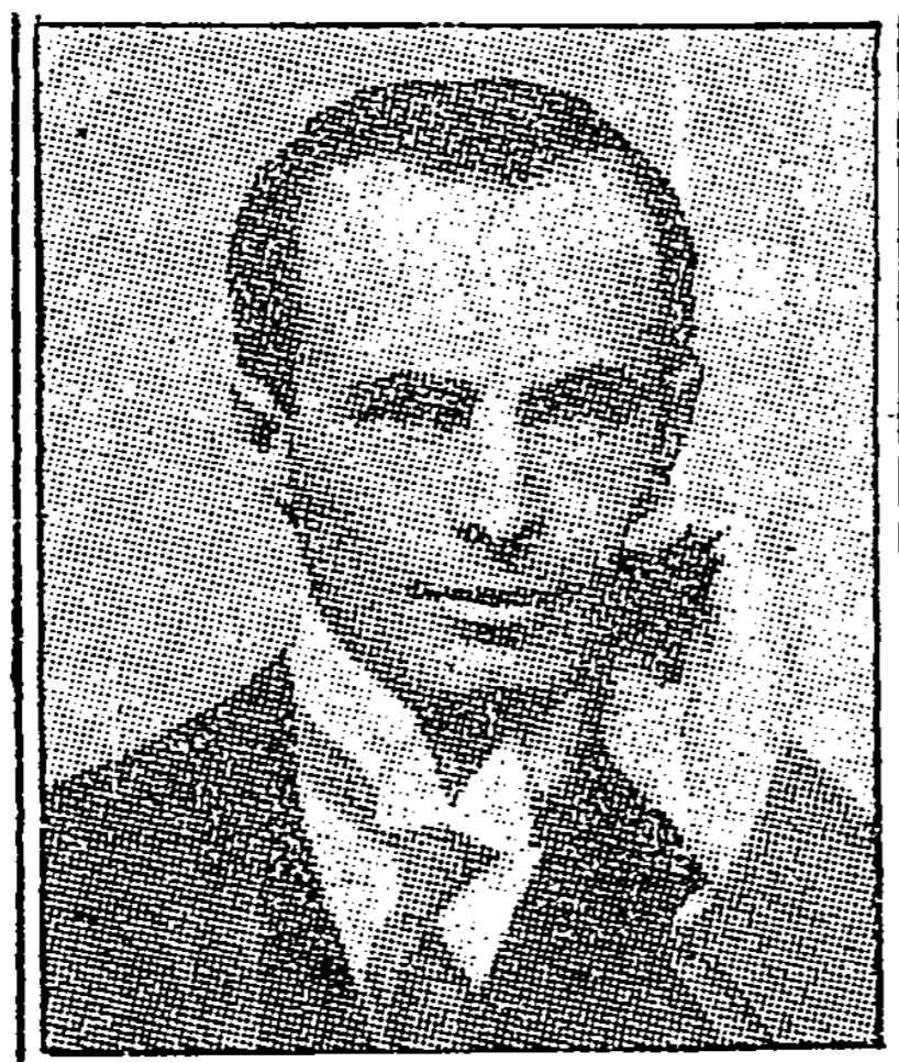
DR. DOUGLAS MAWSON