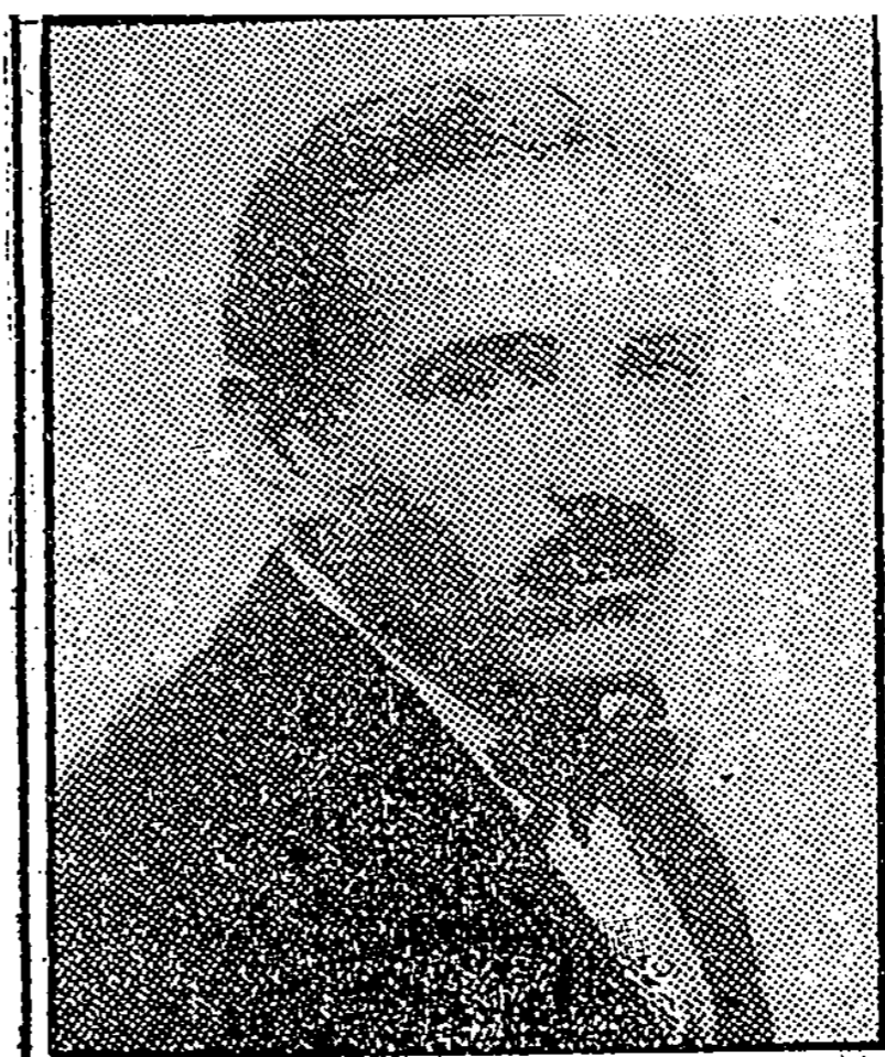
The Late Dr. Xavier Mertz.