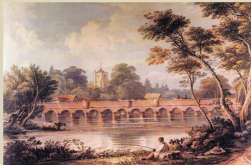
Leatherhead Bridge 1832

Potted Histories No 45 Leatherhead Bridge