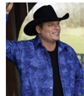
John Michael Montgomery

Johnny Cash at Folsom Prison: Legacy Edition has been released with footage from Cash's legendary performance and recording of At Folsom Prison made Jan.