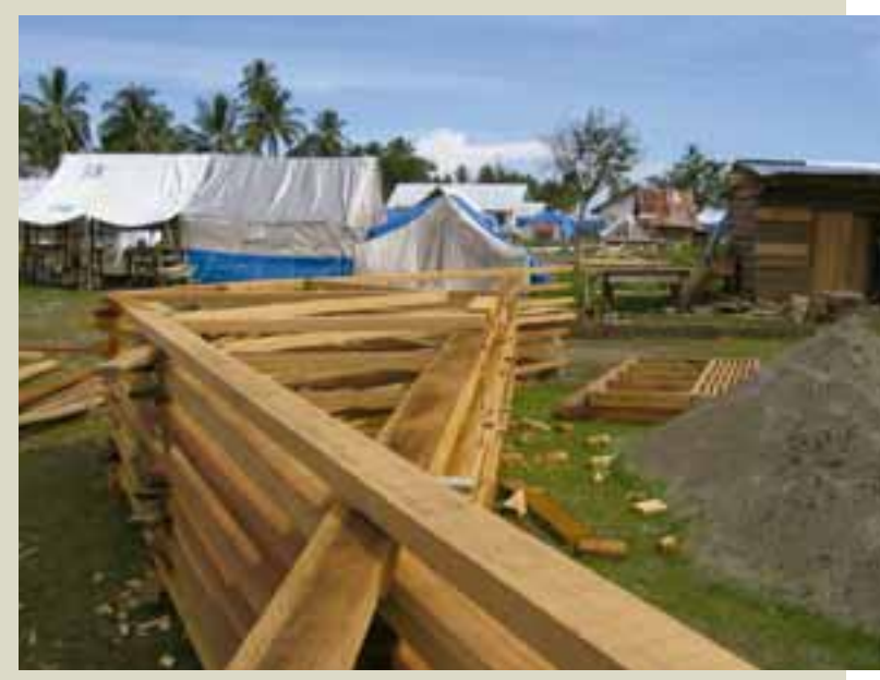
Housing construction underway in Aceh – Meulaboh.

Using technical expertise provided through the Australia Indonesia Partnership for Reconstruction and Development and innovative approaches to land mapping has helped establish a process to rapidly agree on land boundaries as they were before the tsunami.