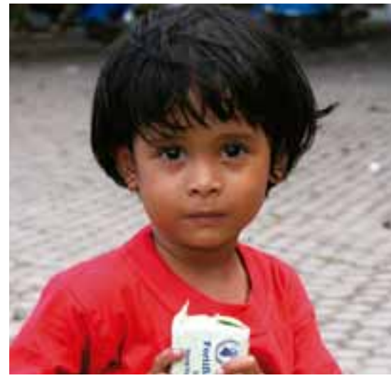
Aid recipient, Aceh.

The Australian Government's emergency relief effort mounted in response to the tsunami disaster was a huge operation. It was the largest peacetime operation Australia has ever launched overseas and