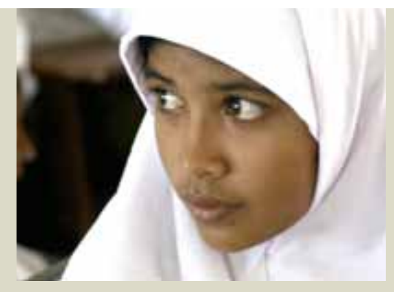
Nursing student, Banda Aceh Hospital complex.

Today, many signs of destruction are still visible, but now ladders, scaffolding and paint brushes are