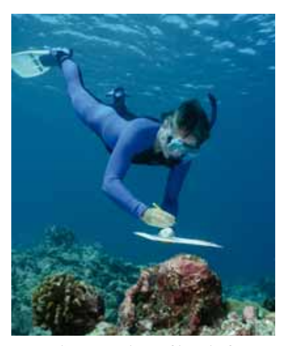
A CSIRO diver examines the state of the coral reef at Mulaku Atoll, Maldives.

At the request of the Maldivian Government, Australia sent a team of marine scientists to assist in assessing tsunami damage to the Maldives coral reefs. The team rapidly assessed the health of 124 coral reef and 65 dive sites, checked for structural