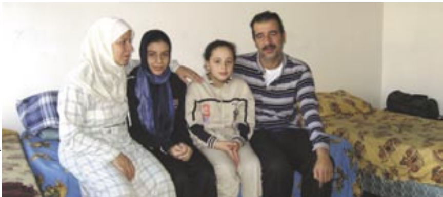
UNHCR / January 2007

A third group of Palestinian refugees consists of individuals who are neither “Palestine refugees” nor “displaced persons” but who, owing