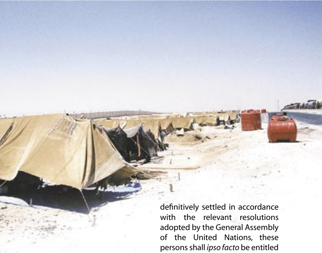
Al-Tanf tented site on the Syria – Iraq border

Article 1D of the 1951 Convention states that the Convention “shall not apply to persons who are at present receiving from organs or agencies of the United Nations other than the United Nations High Commissioner for Refugees protection or assistance. When such protection or assistance has ceased for any reason, without the position of such persons being