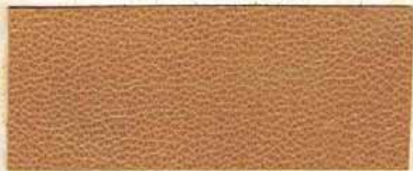
(3.) SEAL (FINE GRAIN).

37022 BB 7140 242.193 CA Faculty Unconformity Cambridge 21.7.2001