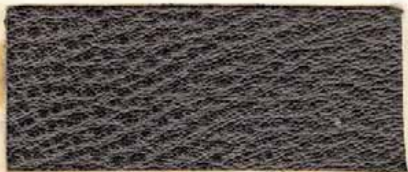
(2.) SEAL (BOLD GRAIN).