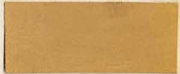
(5.) SHEEP (ROLLER BASIL).