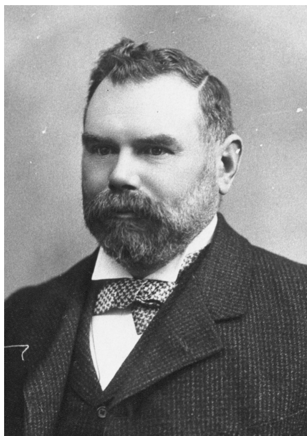
Fig. 5 Thomas Mackenzie, c.1903 5.

The Animals Protection Act was passed on 25 November 1907, six days after the Executive Titles Act, after which Members of the House of Representatives became Members of Parliament, and the Colonial Secretary's Office became the Department of Internal Affairs (Bassett 1997).