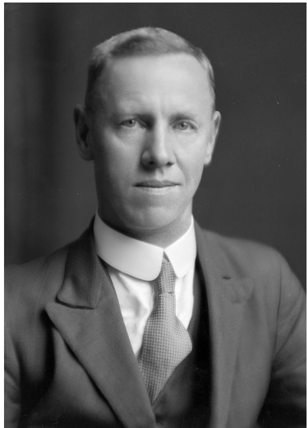
Fig. 7 W.R. Brook Oliver, 1934 7.

According to my views there are two species of kaka in New Zealand and only one appears in the list. Although any argument that the Act as it now stands only applies to the green kaka could not be upheld it would be safer to have the name adopted in my book [i.e. Oliver 1930] for the brown or North Island species gazetted. (IA 25/28/5 Part 3)