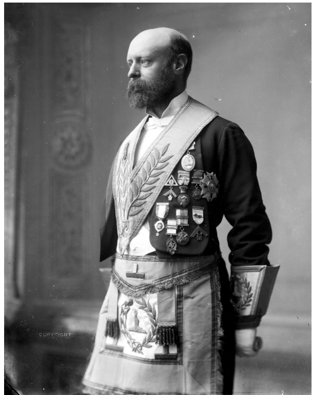
Fig. 2 Lord Onslow, Governor of New Zealand, c.1890 2.