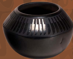
Maria and Julian Martinez San Ildefonso Pottery-Jar 1940s