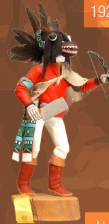
H.L. Sahmie Hopi Kachina- "Nata-aska, Black Ogre" 1980s