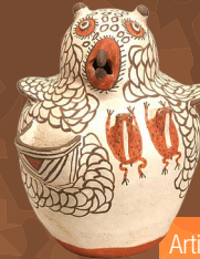
Artist Unknown Zuni Pottery-Owl Effigy with prayer bowl 1920s