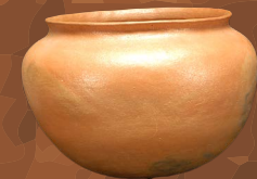
Artist Unknown Picuris Pottery-Olla 1980s