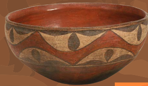
Artist Unknown Zia Pottery-Bowl 1910s