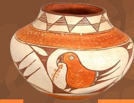
Artist Unknown Acoma Pottery-Bowl 1930s