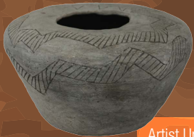
Artist Unknown Ancestral Pueblo Pottery-Chaco Seed Bowl A.D. 1050-1125

All of the pieces below are in the Davies collection. They are shown here from oldest to newest. HOW MANY CAN YOU FIND?