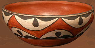
Artist Unknown Zia Pottery-Bowl 1940s