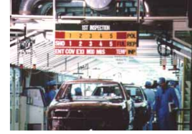
Andon electric light board

Standardized work is essential to identifying where things go wrong, Minoura says. "If you're turning out something in a different way from that on the standardized work sheet, or different from the way other people are doing it, that's the definition of a problem. By thinking about what is causing the problem, the problem itself will come into view. When the problem becomes clear this will lead to kaizen . If you make it a rule to deal with defects only when they occur, the number of staff you need will drop straight away. Things that are running smoothly should not be subject to