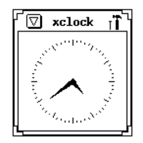
Figure 1: OpenLook+ Decoration

The openLook panel defined above is made up of four objects. In the above example, the button object called "name" has the letter "C" as its column coordinate, meaning to center the object within the row.