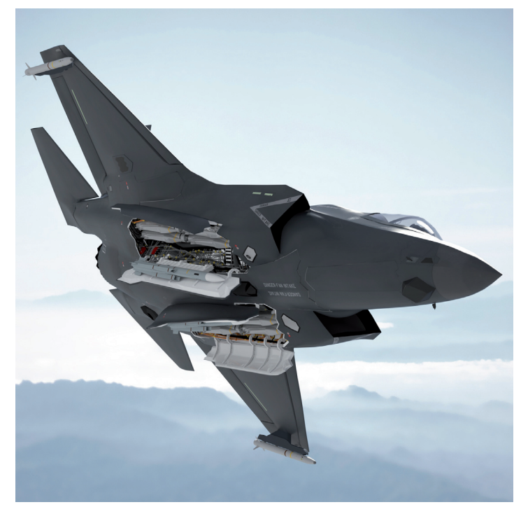
2 x ASRAAM, 4 x Meteor – total domination of the airspace