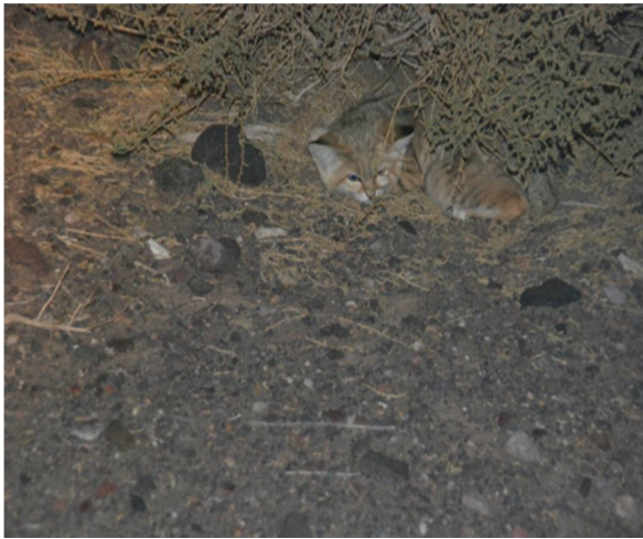
Figure 1. F. margarita in the study area

We tried to investigate on the relationship of the species nocturnal activity with the moon brightness in different lunar nights. Encounter rate was calculated given the length of the path traversed and the number of individuals observed. To estimate population size and density, software packages including Distance ver. 6.2 and SPSS ver. 22 were used.