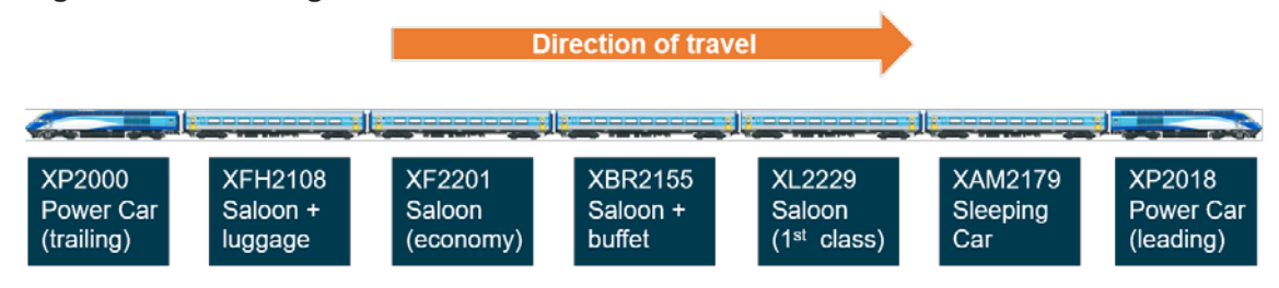
Figure 5: Train configuration