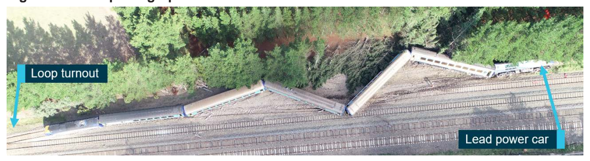
Figure 3: Aerial photograph of derailment site

At about 1943, XPT ST23 was approaching the northern end of Wallan Loop at about the track's line speed. Recordings from the train indicate an Emergency brake application a short distance before the points. This slowed the train a small amount before it entered the turnout travelling at a speed in excess of 100 km/h. The train was not able to negotiate the turnout to the loop track at this speed and derailed. All vehicles derailed excepting the rear power car (Figure 3).