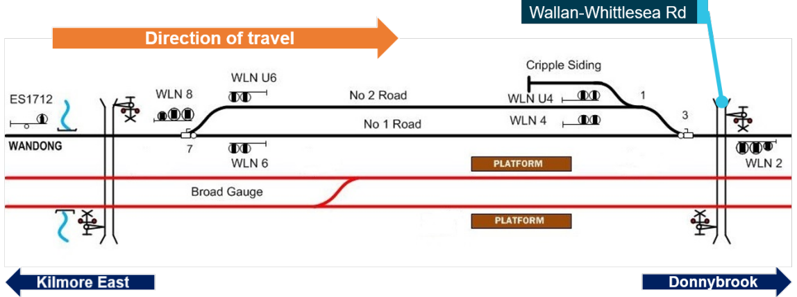
Figure 4: Wallan Loop (standard-gauge track shown in black, with signals)