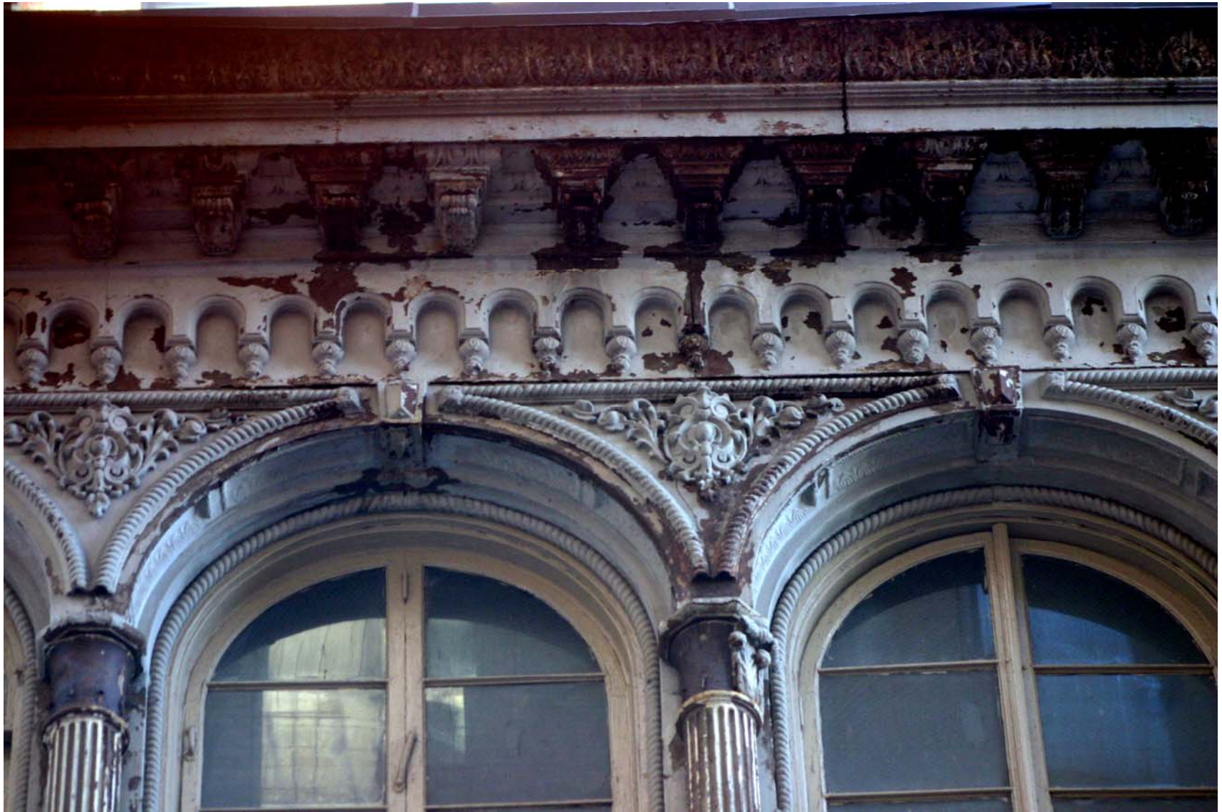
63 Nassau Street Building, cornice