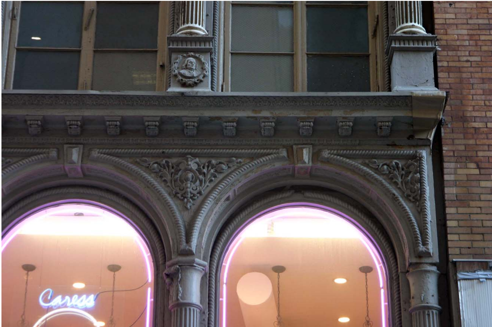
63 Nassau Street Building , second story detail