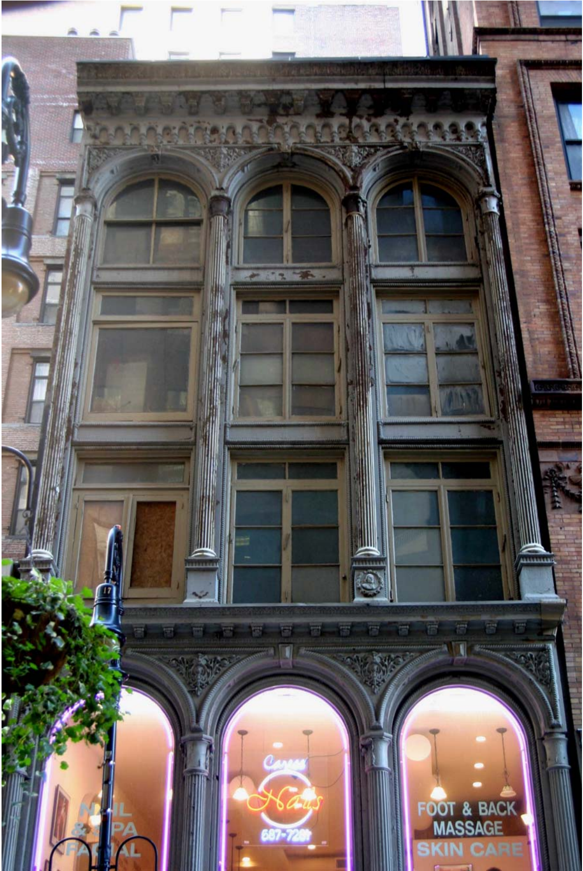
63 Nassau Street Building, Manhattan