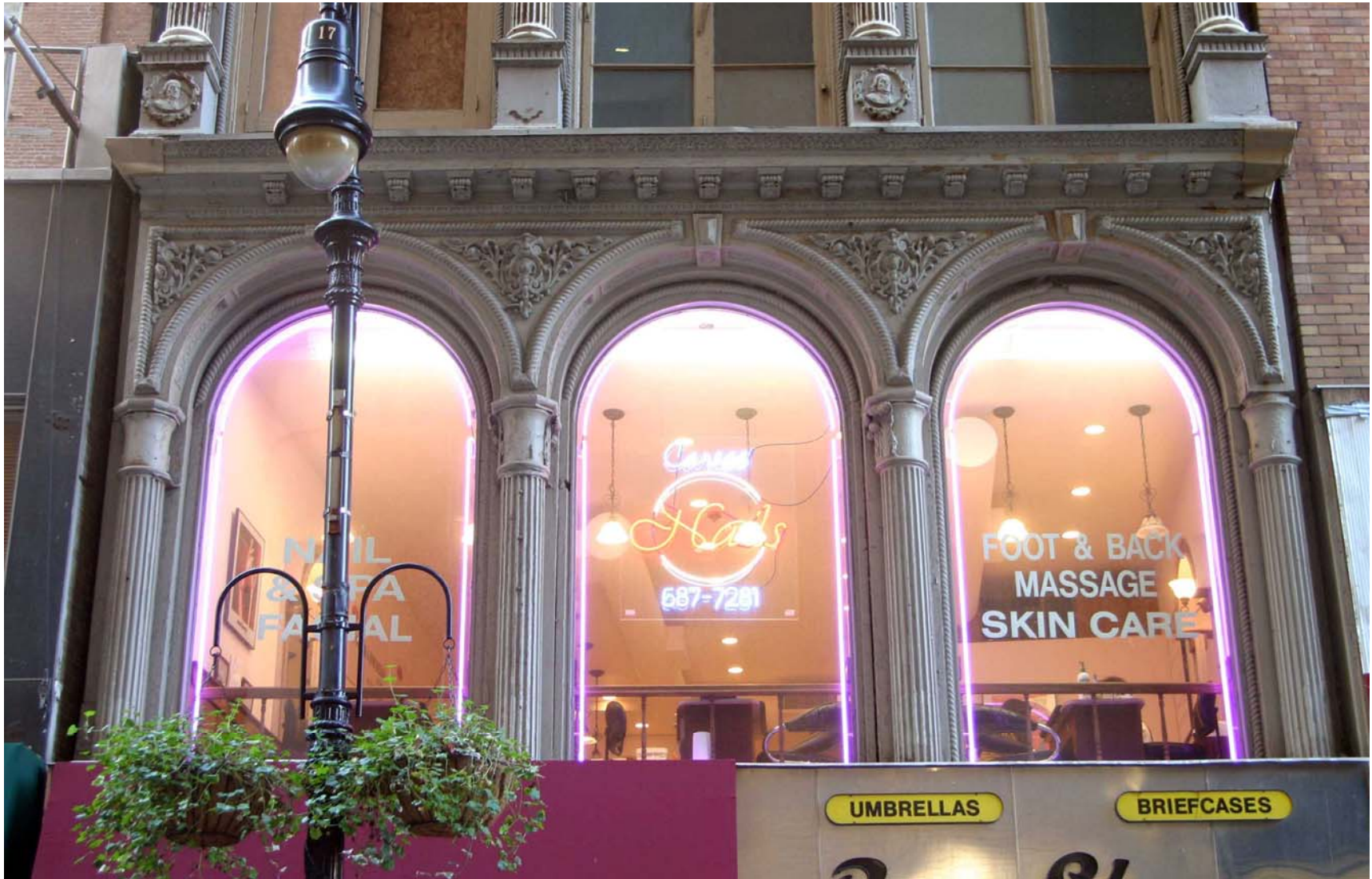
63 Nassau Street Building, second story