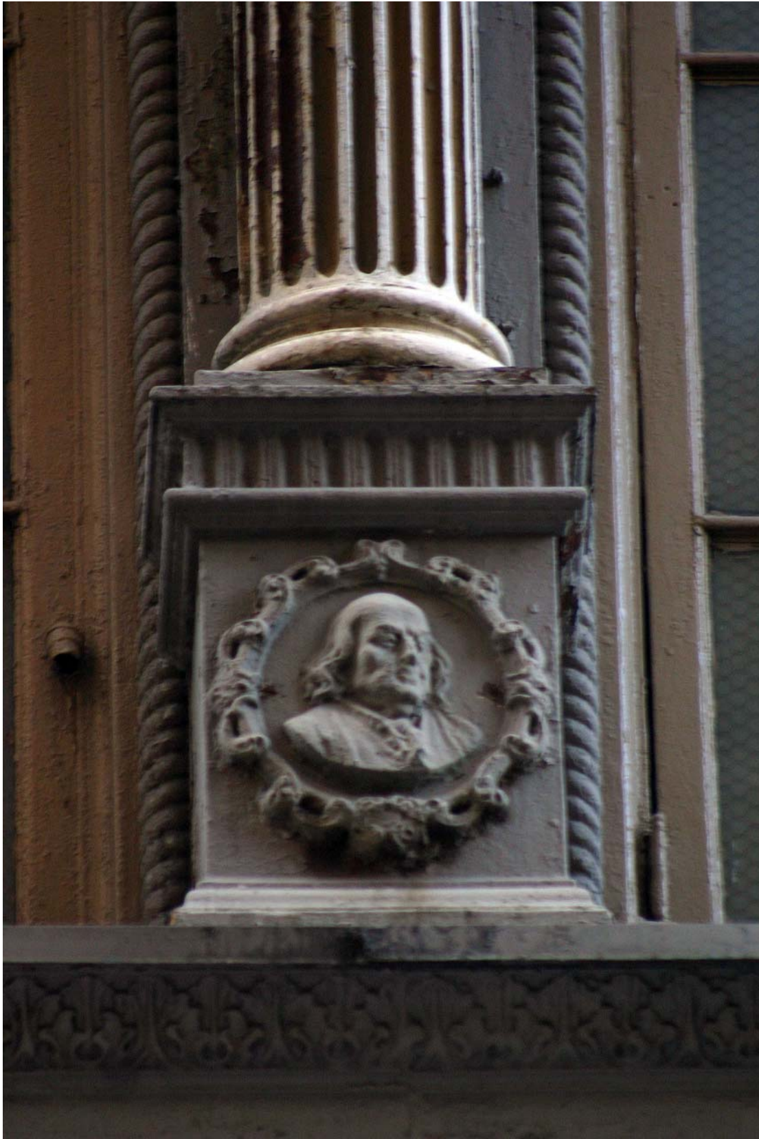
63 Nassau Street Building , medallion of Benjamin Franklin on third story