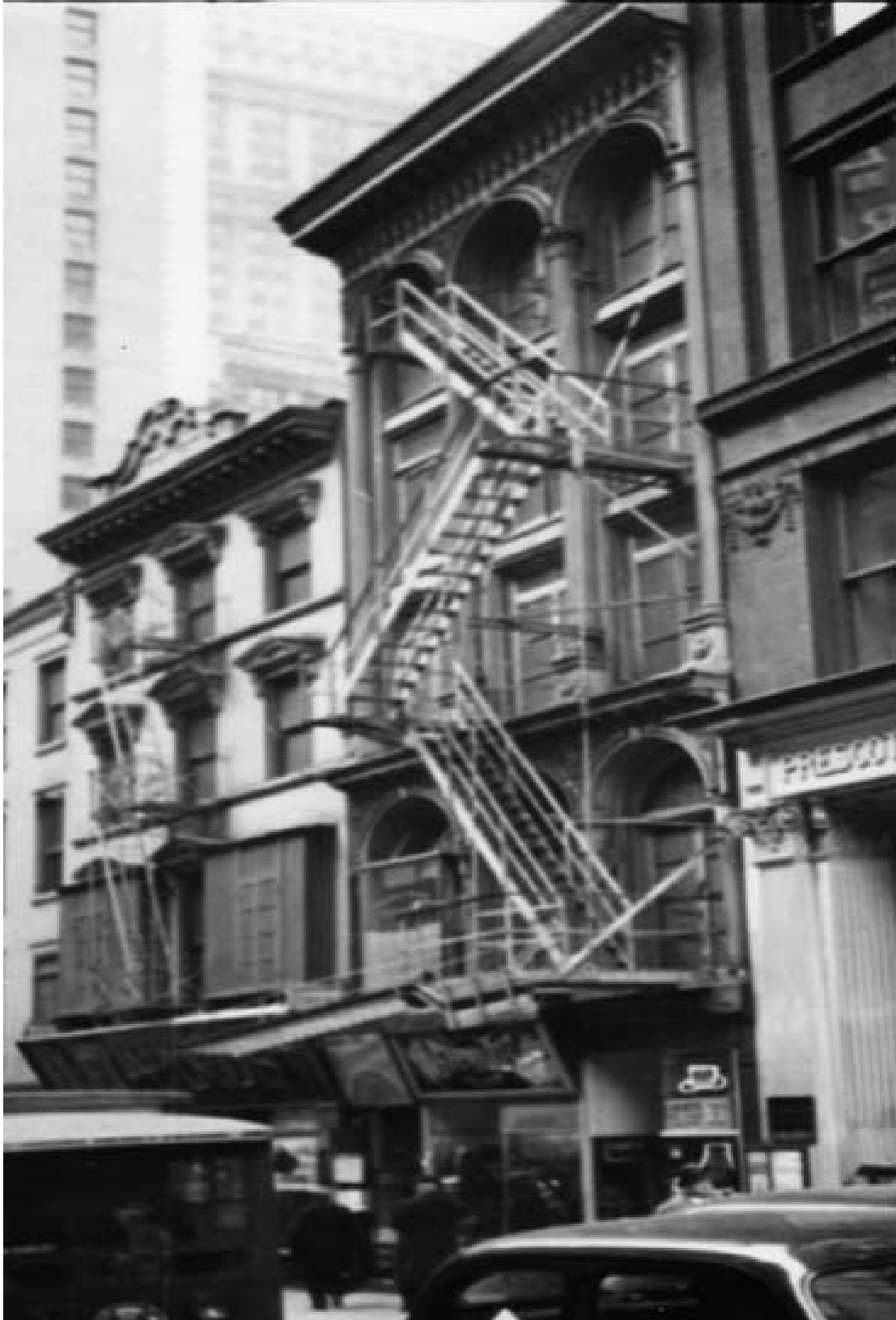
63 Nassau Street Building , Manhattan