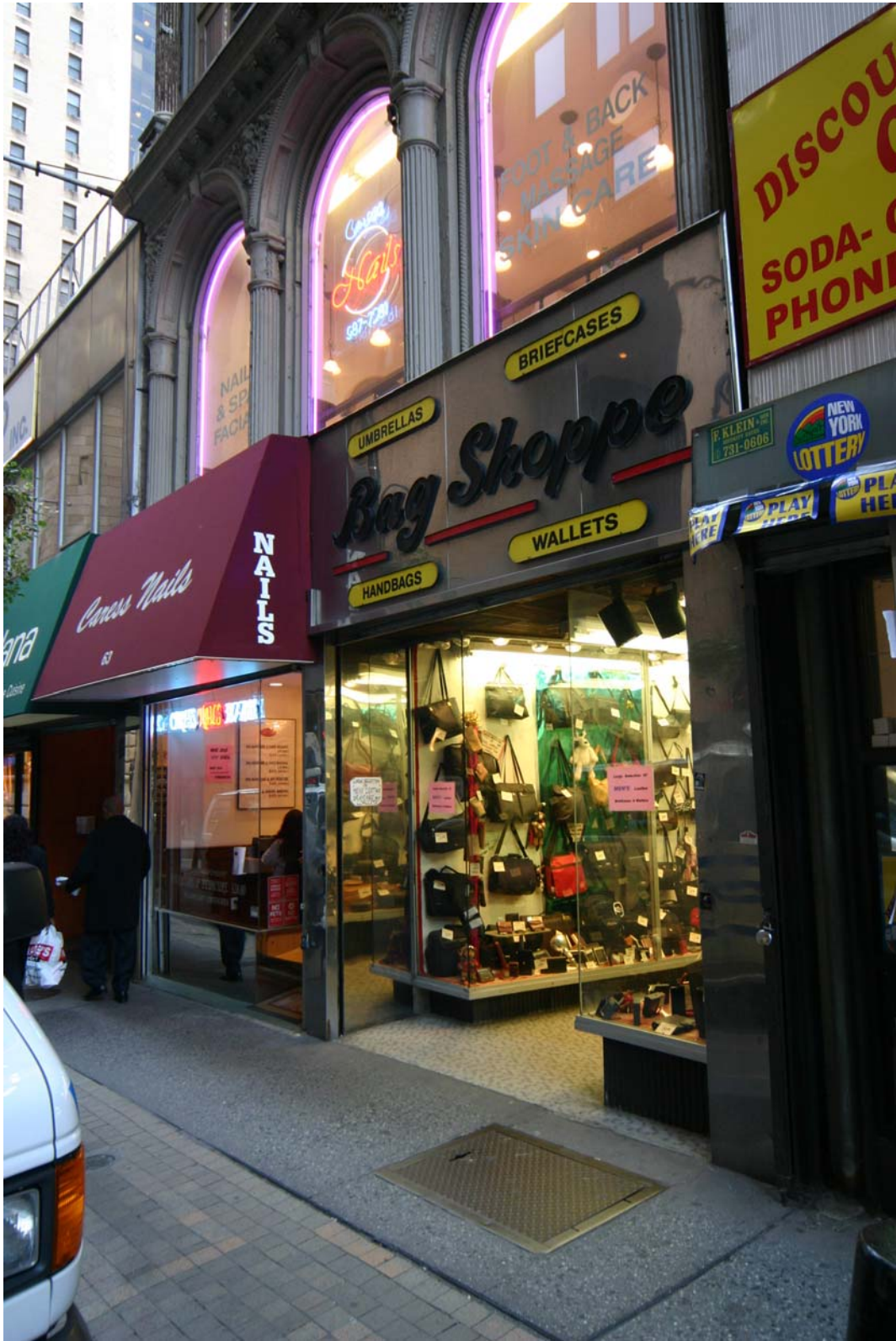
63 Nassau Street Building, Bag Shoppe storefront (c. 1961)