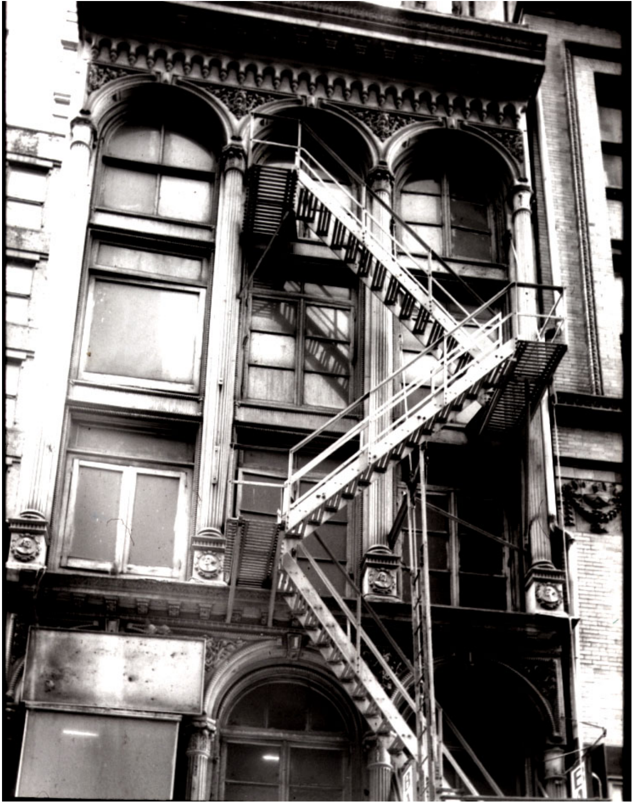
63 Nassau Street Building , Manhattan