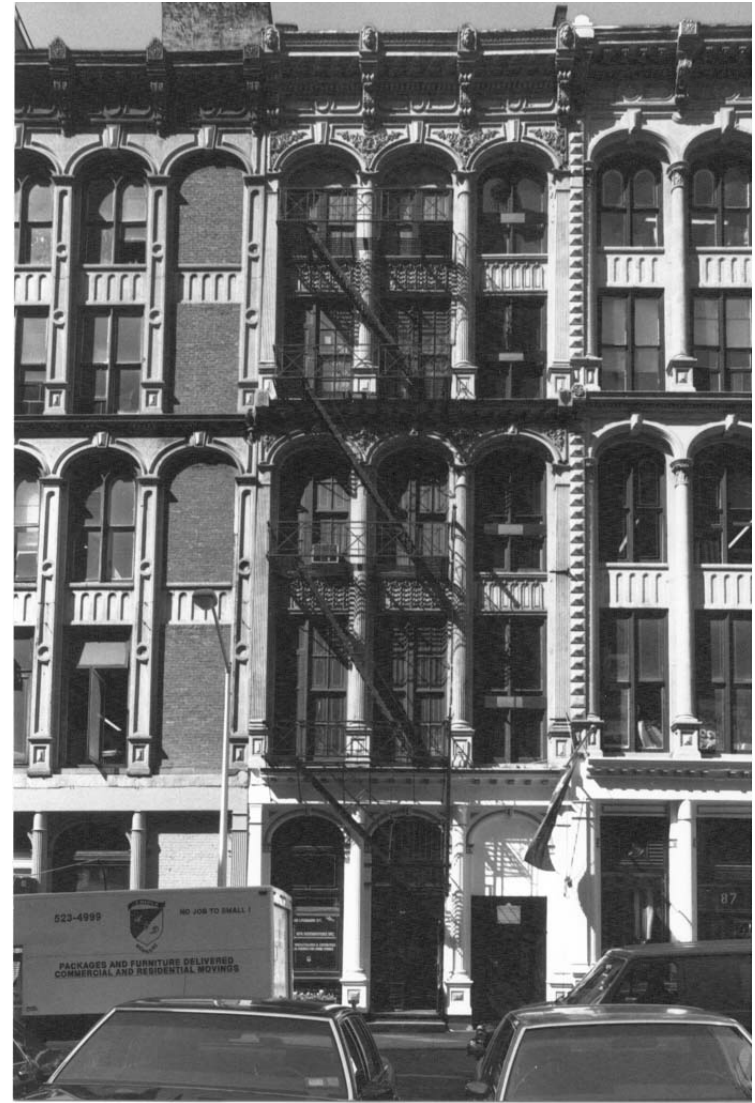
Kitchen, Montross & Wilcox Store (1860-61, James Bogardus), cast-iron façade