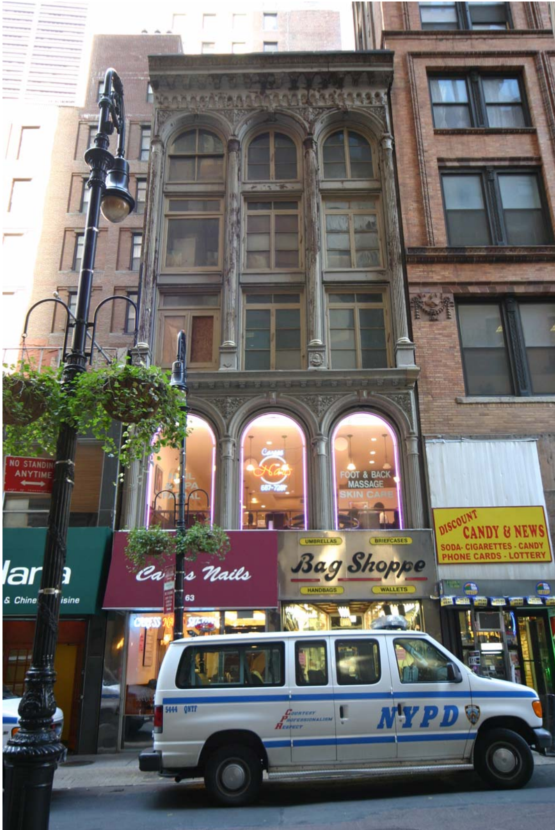
63 Nassau Street Building, Manhattan