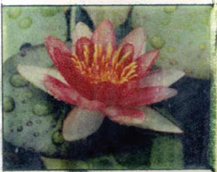
I wet watercolor paper and squeezed the excess moisture off before making this transfer. You can see the image is a bit more blurry than the following one in which I used dry paper.