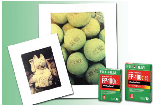
▲ Image Transfers from Fujifilm FP-100C45 using a DayLab® Printing System and Arches® Smooth Fine Art Paper