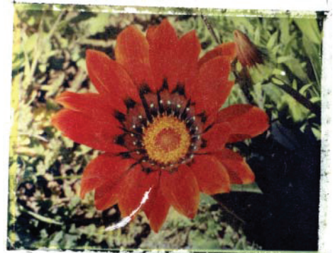
I used a blue filter on this picture, still using the arches 88 printmaking paper.