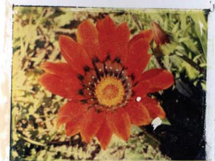
This picture was made with a Daylab® pro on Arches 88 printmaking paper with Fujifilm FP-100c film.

The time frame for peeling apart the film is similar in the Polaroid and Fujifilm films. Polaroid says 10-15 seconds, even though with that film I like to wait more like 20-25 seconds. Since I do my work under a box with the Fujifilm film, it takes a bit longer to set up than the Polaroid, so I have to work faster. To create a dark environment in which to peel apart the Fujifilm film, I took a carton, removed the top flaps, then removed one side panel. I turned it upside down and put it in a black pillowcase with the opening where I removed the panel. That way I can easily slide my arms in and work in the darkened box, allowing the fabric to fall around my arms so no light can get in (or very little). I still lower the lights but it's much better than working in almost darkness. After setting up my image on the Daylab pro, I pull out the 2nd tab and cut off the two sides of the film, leaving about an inch above the picture on the longer tab. I place the photograph face down on the receptor sheet where I want it, and clamp the top tab of the Fujifilm film to the receptor paper, leaving the middle tab in between them unattached. I do that so that I can center the image on the paper and have it stay there, when I move it into