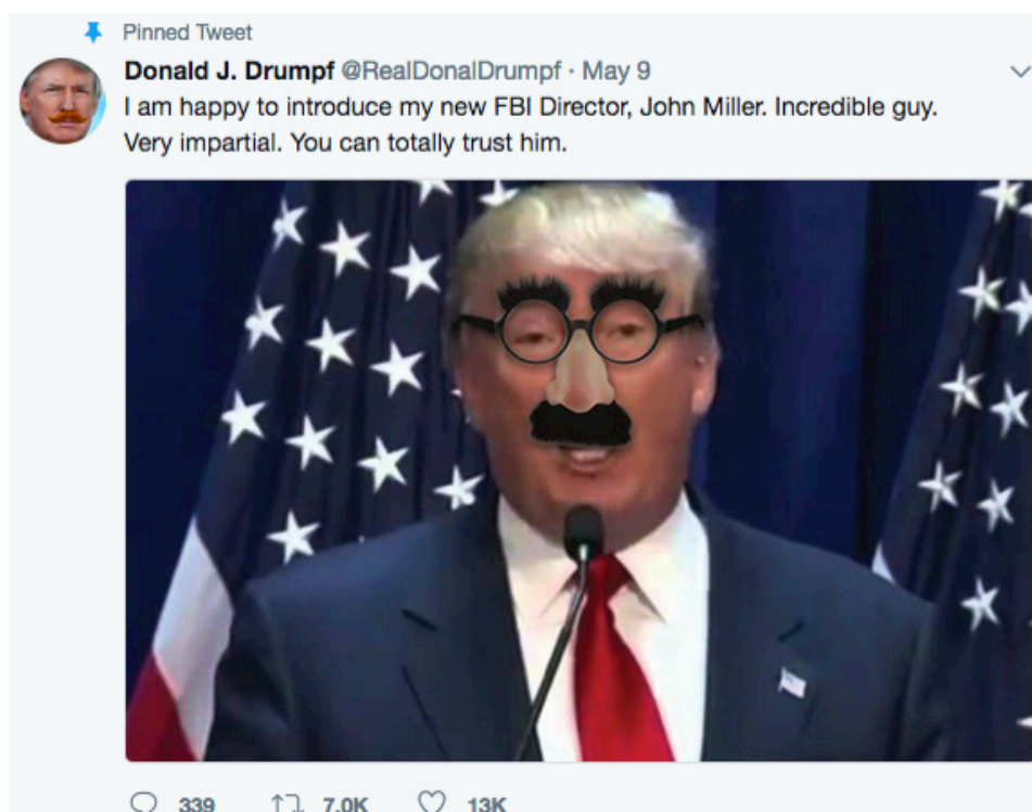
Figure 3: Tweet by @RealDonalDrumpf

Consider the following two examples. Figure 3 is a humorous comment on Trump’s firing of FBI Director James Comey, figure 4 suggests that Trump may just like Richard Nixon face impeachment. Meme and social media culture is in such cases turned into a left-wing strategy. For characterising such strategies, we do not need the term left populism, but can rather speak of left cultural politics or critical cultural politics. The term left populism in contrast risks association with a politics that is nationalist or xenophobic, does everything necessary and does not shy away from any tactic in order to appeal to as many people as possible.