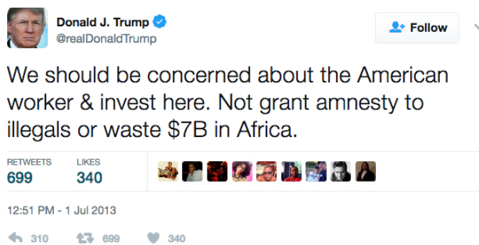
Figure 2: Tweet by Donald Trump, example 2

In a nationalist manner, Trump communicates the need to “make America great again”. National greatness is said to have come under threat by illegal immigrants, Africans, transfer of taxes to foreigners, and development aid. Americanness and the American interest are identified with the American working class, while un-Americanness is identified with immigrants and the developing world.