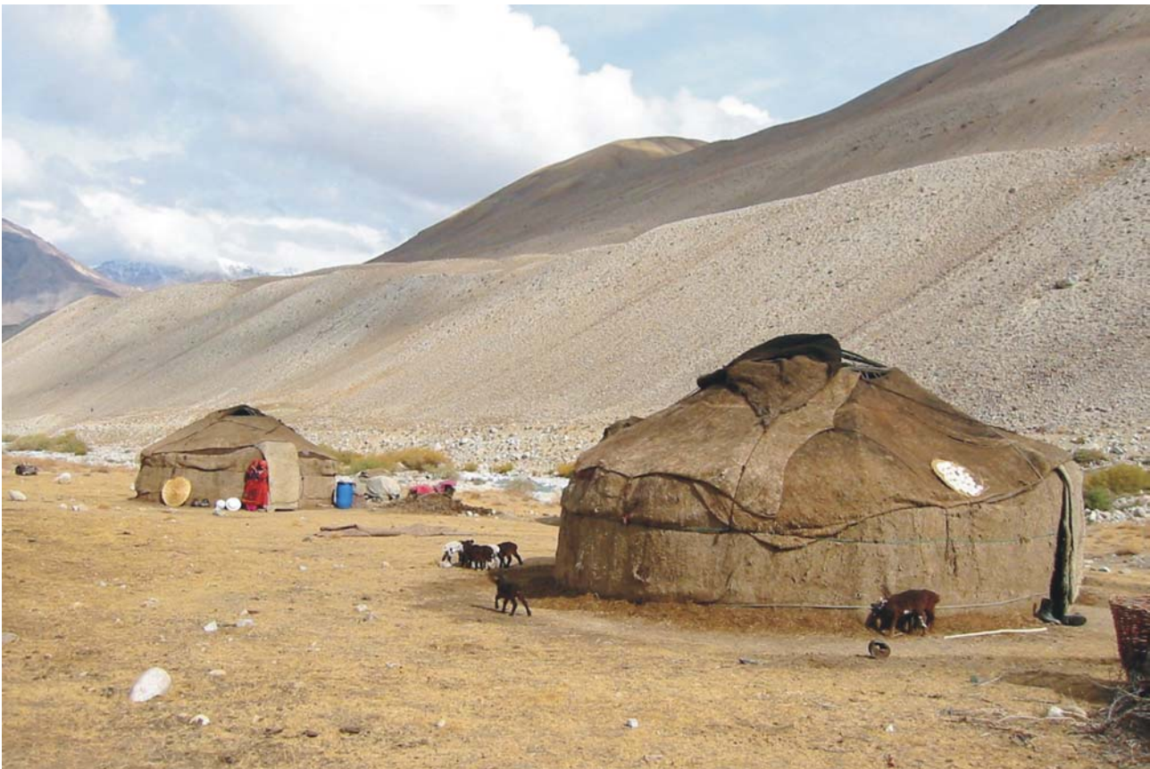
Domed felt tent yurt

The southern frontier with Pakistan runs along the ridge and watershed of the mountains, which make the easternmost spurs of the Hindu Kush range until they merge in a jumble of high mountains and glaciers where the Pamir and the Karakoram ranges meet on the borders of China, Afghanistan, and Pakistan.