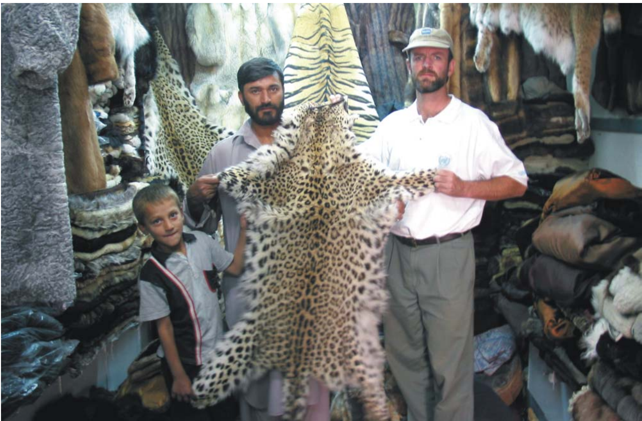
Snow leopard skin in Chicken Street fur shop, Kabul

In all ten instances of snow leopard killing that we recorded in the Wakhan Corridor, the hunters skinned the carcass for fur but discarded the rest of the body parts. The furs were sold in most cases, with prices ranging between an equivalent of less than US$15 up to US$140 (see Annex 5 Wildlife Anecdotes). Most