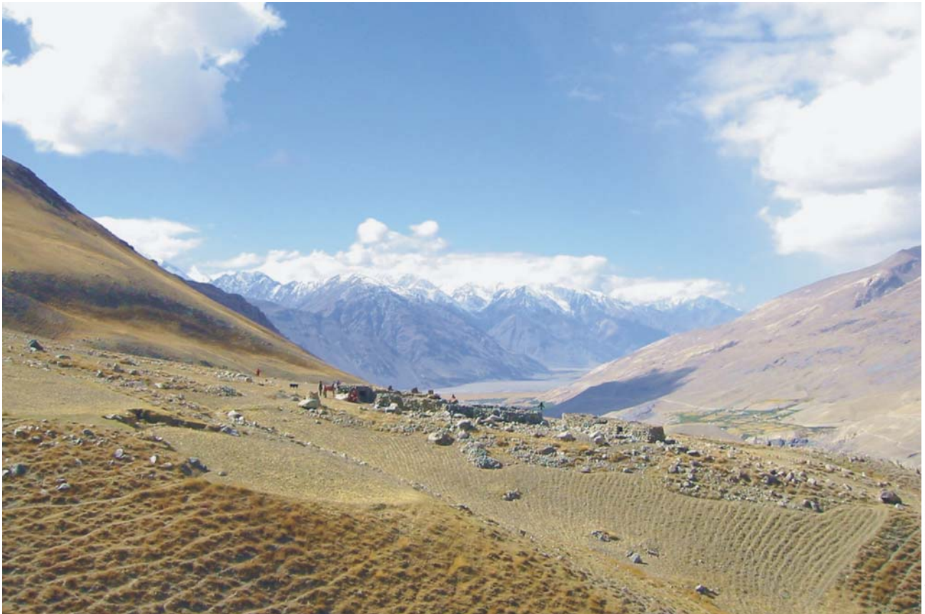
Yupgaz valley region

All back in Yupgaz camp 16.30 hrs. Signs of brown bear and young (old droppings) in barley stubble. Fine cold night.