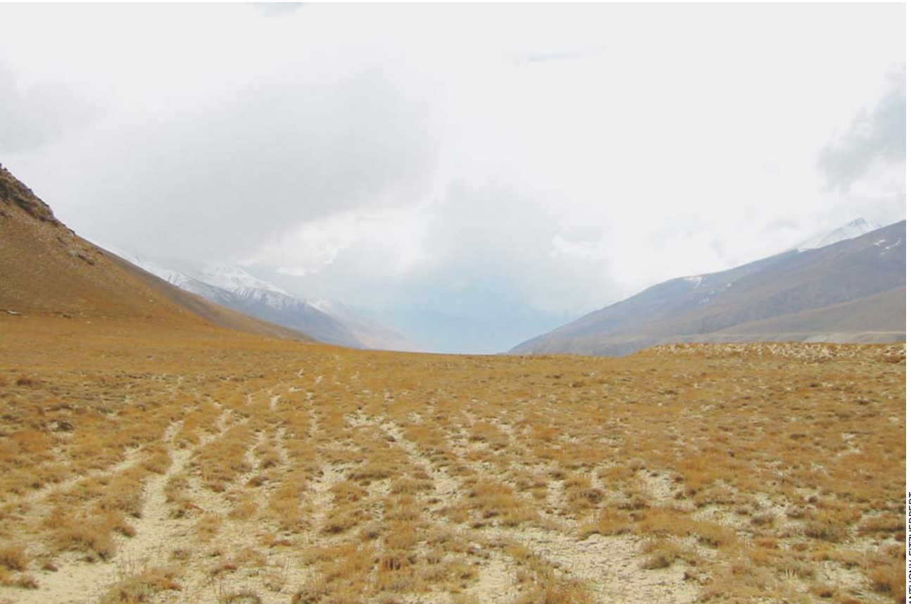
Sheep and goats on the main drive road in the Pamir Valley