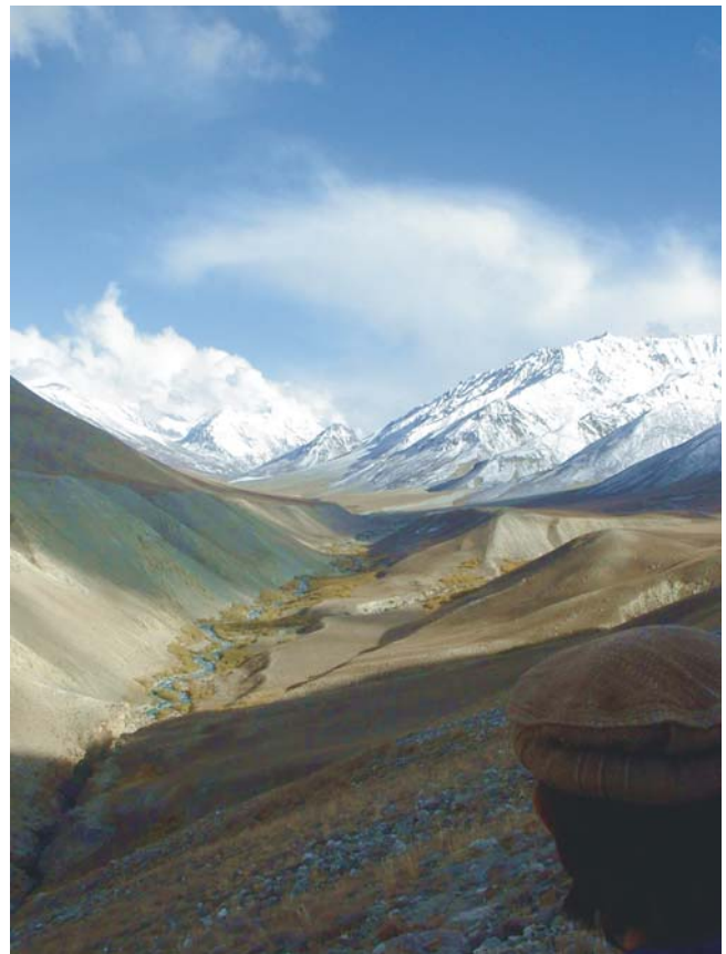
Ishtemich valley region

Overnight c/o Bakhshah and other herders. Discussions with herders.