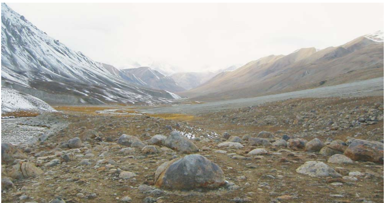
Shikargah valley region