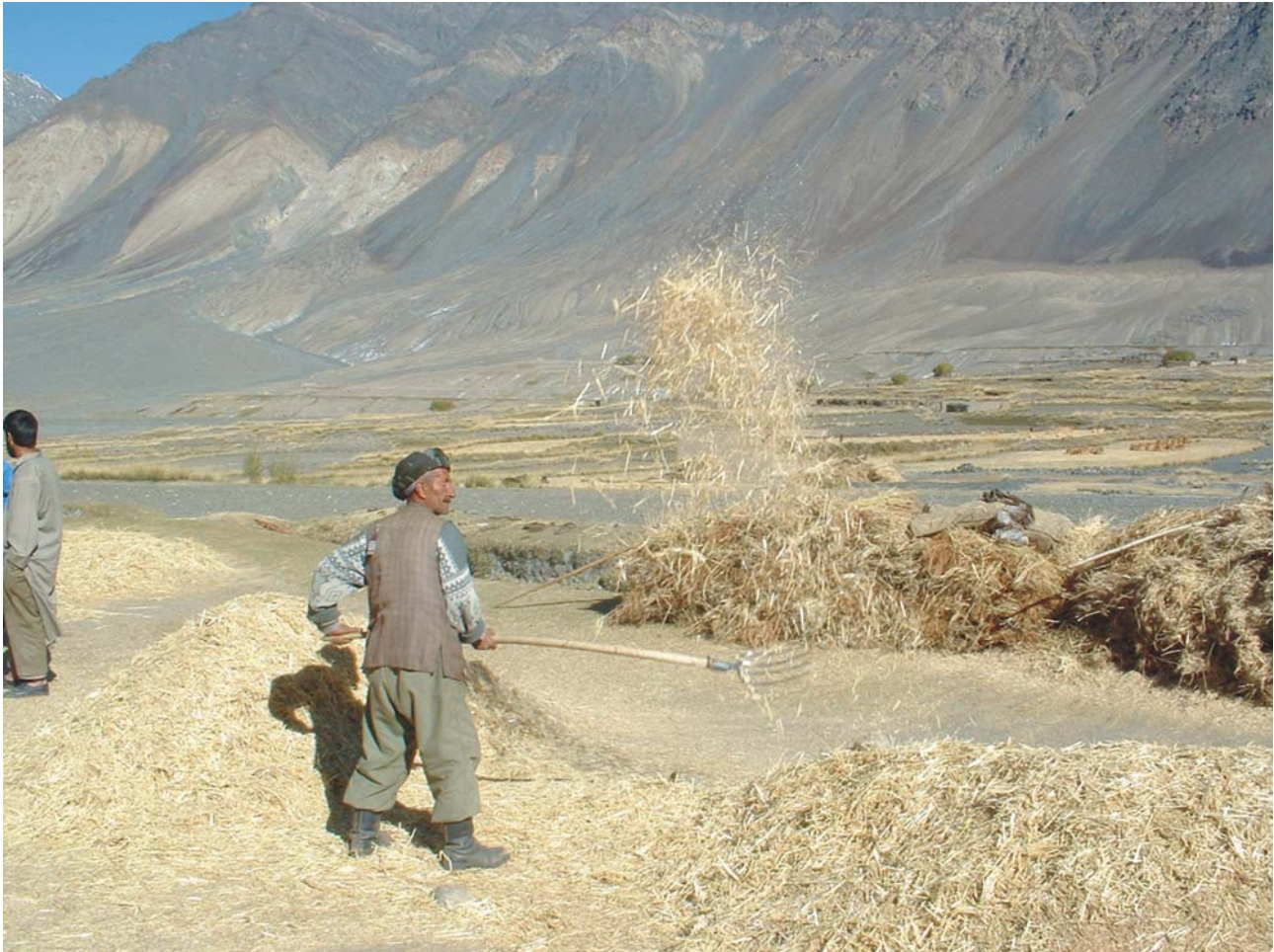
Man winnowing wheat in Wakhan valley

ally, the harvest did not look bad, although farmers, as everywhere, were being cautious about predicting their yields until they had completed threshing. Little if any chemical fertilizer is used here, and there was little evidence of any recent successful introductions of improved, better-yielding varieties. In fact, farmers spoken to in four different villages in the main Wakhan strip complained that recent introductions of 'improved' wheat seed ( fokhm-e-islahi ) by FOCUS had not been a success.