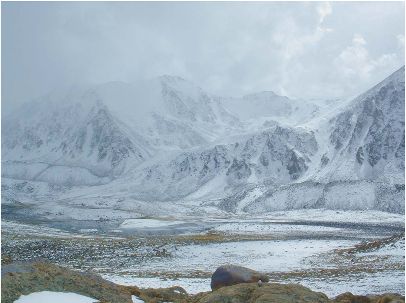
Chap Kol Lake in Shikargah valley region

Overnight c/o Bakhshah and other herders. More discussions. Fine cold night.