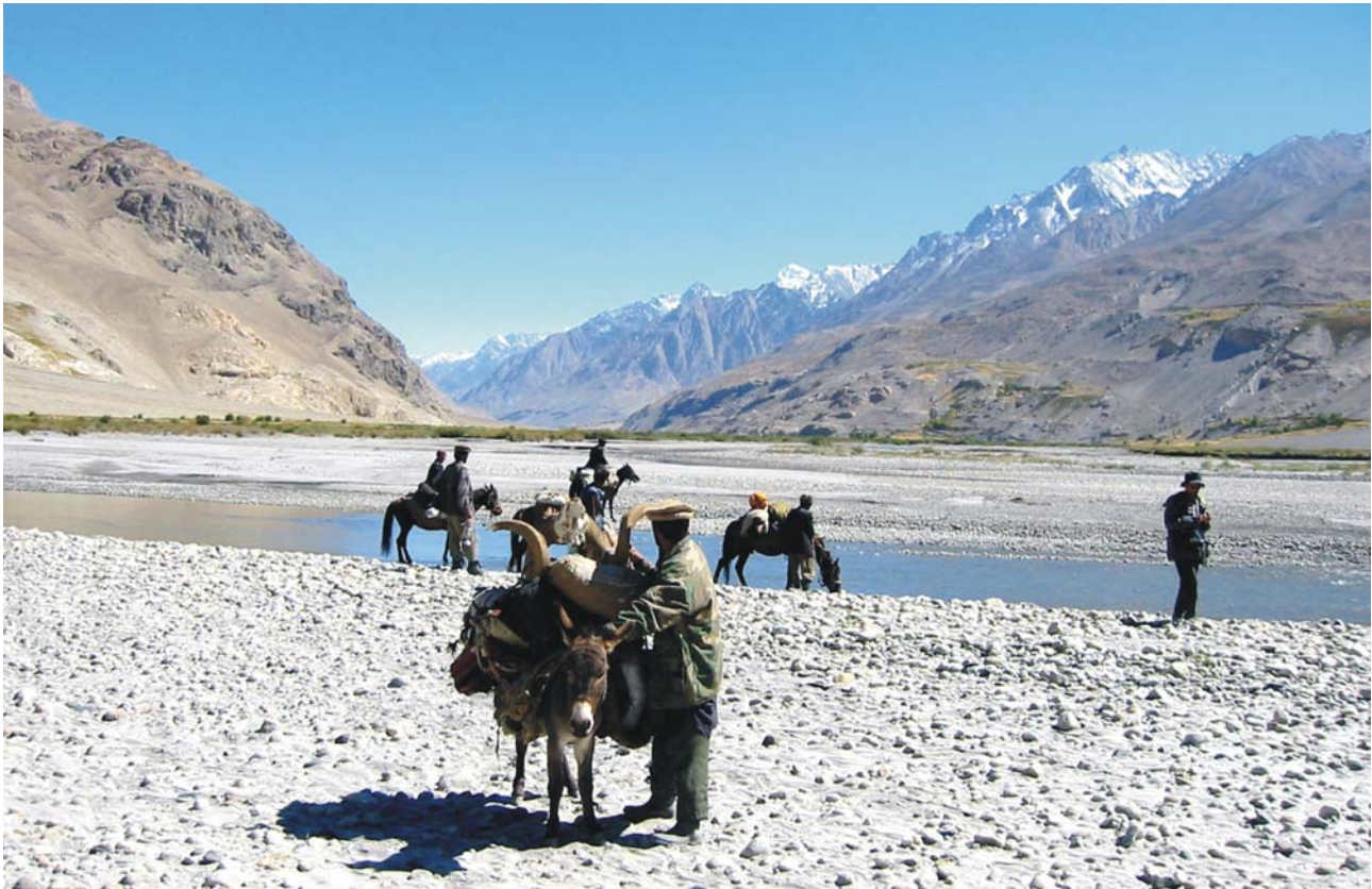
Ghaz Khan region

Overnight-Camp at Jangal-e-Gurvash in riverine scrub by the Pamir River.