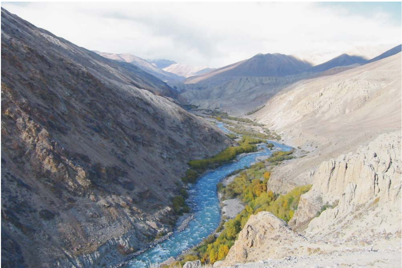
Riparian vegetation along Pamir river

Most of Wakhan and the Pamirs are too high and bleak for forest cover, but there is a fringe of scrubby tree cover along many parts of the river line, mainly consisting of willow ( Salix , at least two species), birch ( Betula , one species), wild rose ( Rosae , two or three species), Berberis , sea buckthorn ( Hippophae rhamnoides ), wild currant Ribes , (one species), Myricaria germanica and others. These provide good nesting sites for a number of passerine birds and a refuge while on migration as well as cover for game birds such the ubiquitous chukar partridge ( Alectoris chukar ). These riverine thickets are also reported to be a source of autumn feeding on the berries for the brown bear population. Apart from firewood and some construction timber, the human population does not appear to make use of these trees or of the wild fruits and berries, which because of the Russian influence are used to some extent by the rural population across the frontier in Tajikistan.