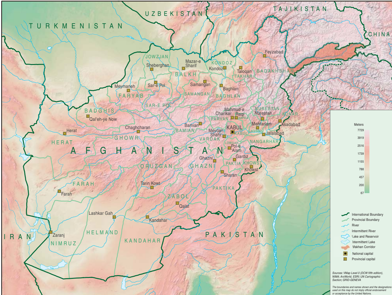
The Wakhan Corridor is located in the north-east of Afghanistan (shaded region)

The Wakhan Corridor, and in particular its eastern end in the Pamir Knot, has always been one of the most remote and least accessible corners of Afghanistan. It is well to note that the distance between Faizabad, the provincial capital of Badakhshan (already one of the remotest Afghan provincial centres), and the eastern tip of the Wakhan Corridor/Pamir Knot on the Chinese frontier is almost as far as from Faizabad to Islamabad in Pakistan, without the roads.