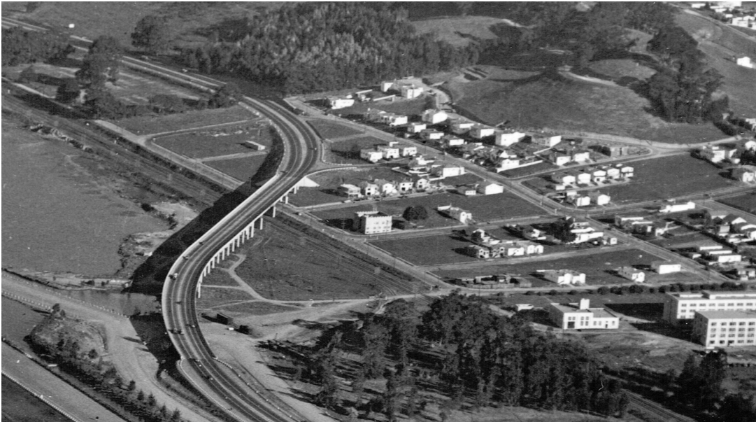
Aerial view circa 1941 shows the four-lane overpass crossing the railroad tracks and the entrance and exit at Pierce Street in Albany. The new USDA regional laboratory is at the right. This view is before construction of the new Industrial or Shipyard Highway (forerunner of I-580) that would branch off at the left and the Shipyard Railway.

veloped. Residents complained about poor sightlines and being unable to back out of their driveways with all the new traffic coming over the rise.