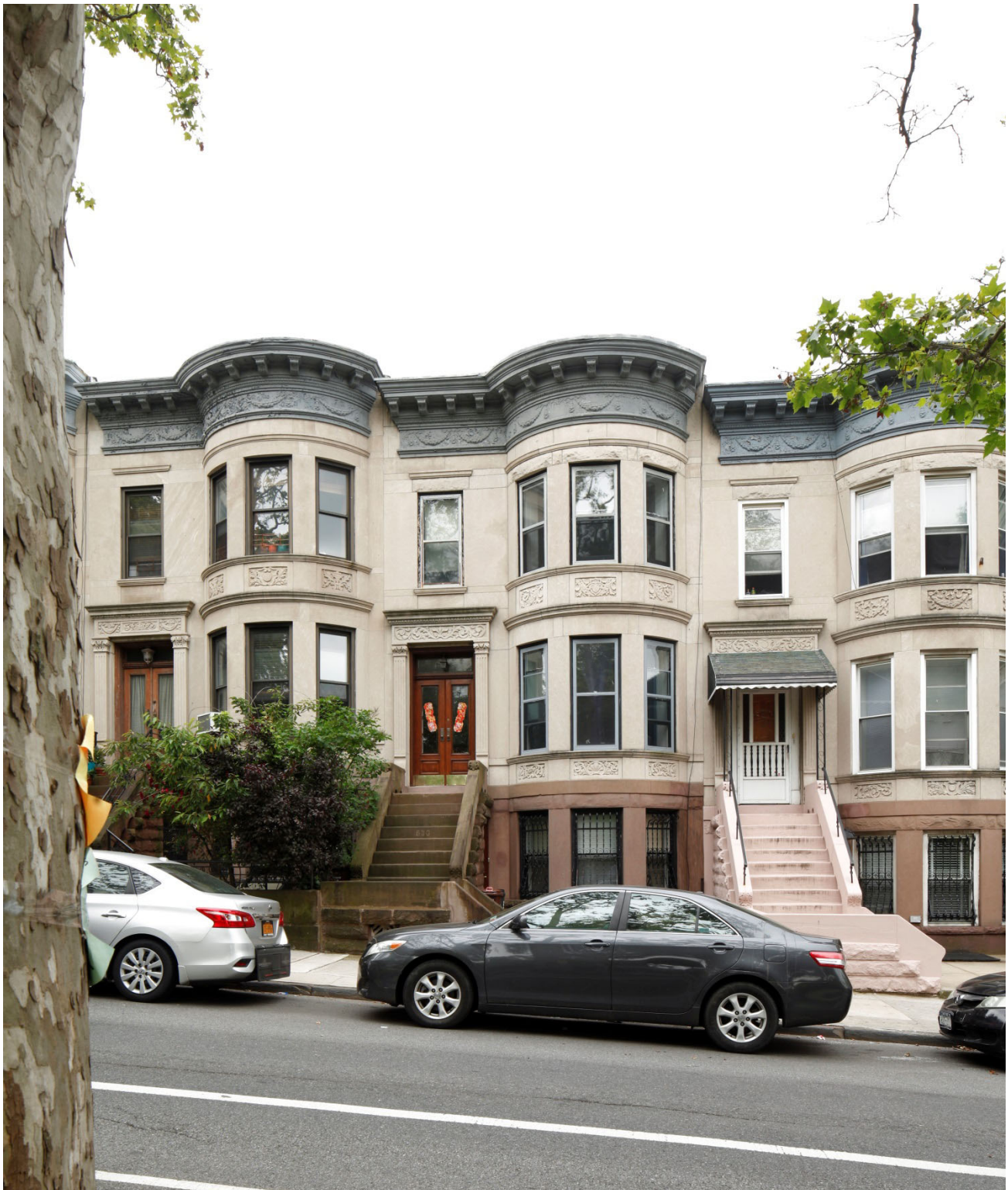
Figure 4 534, 530, and 528 44th Street LPC, 2019