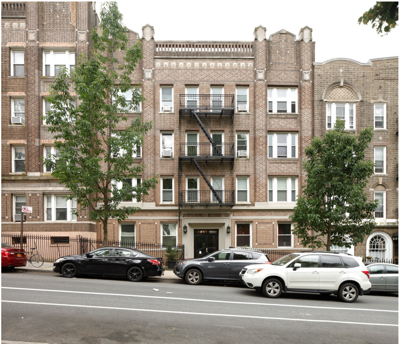
Figure 7 574 44th Street LPC, 2019