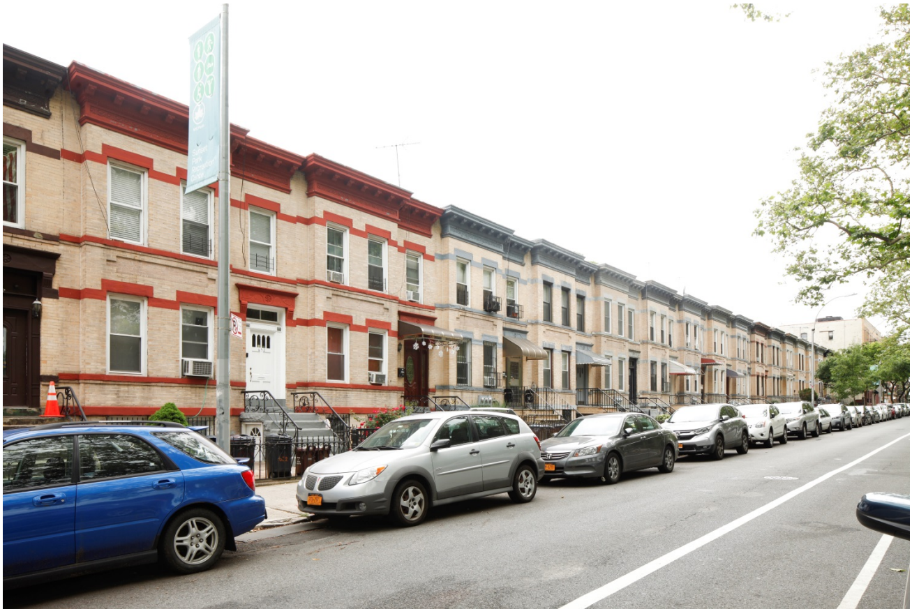
Figure 1 Portion of the row at 614 to 682 44th Street (William E. Kay, 1903) LPC, 2019