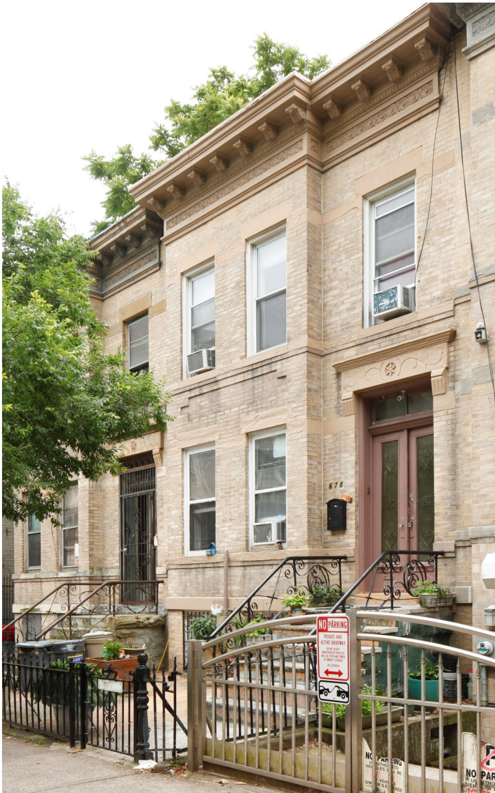
Figure 2 678 44th Street LPC, 2019