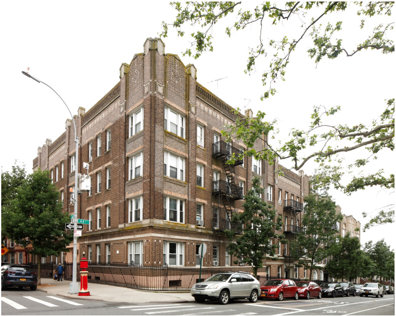
Figure 5 4404 Sixth Avenue and 574, 570, and 566 44th Street (Eisenla & Carlson, 1914 & 1913) LPC, 2019