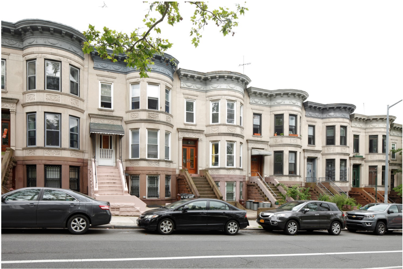
Figure 3 Portion of the row at 514 to 560 44th Street (Thomas Bennett, 1908) LPC, 2019