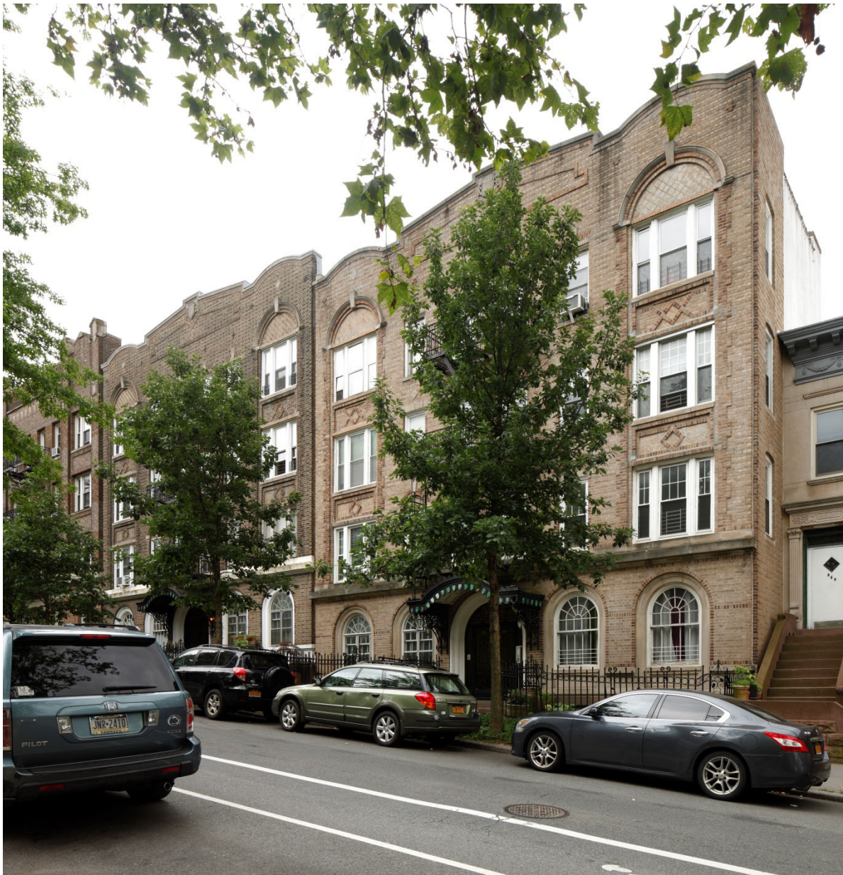
Figure 6 570 and 566 44th Street LPC, 2019