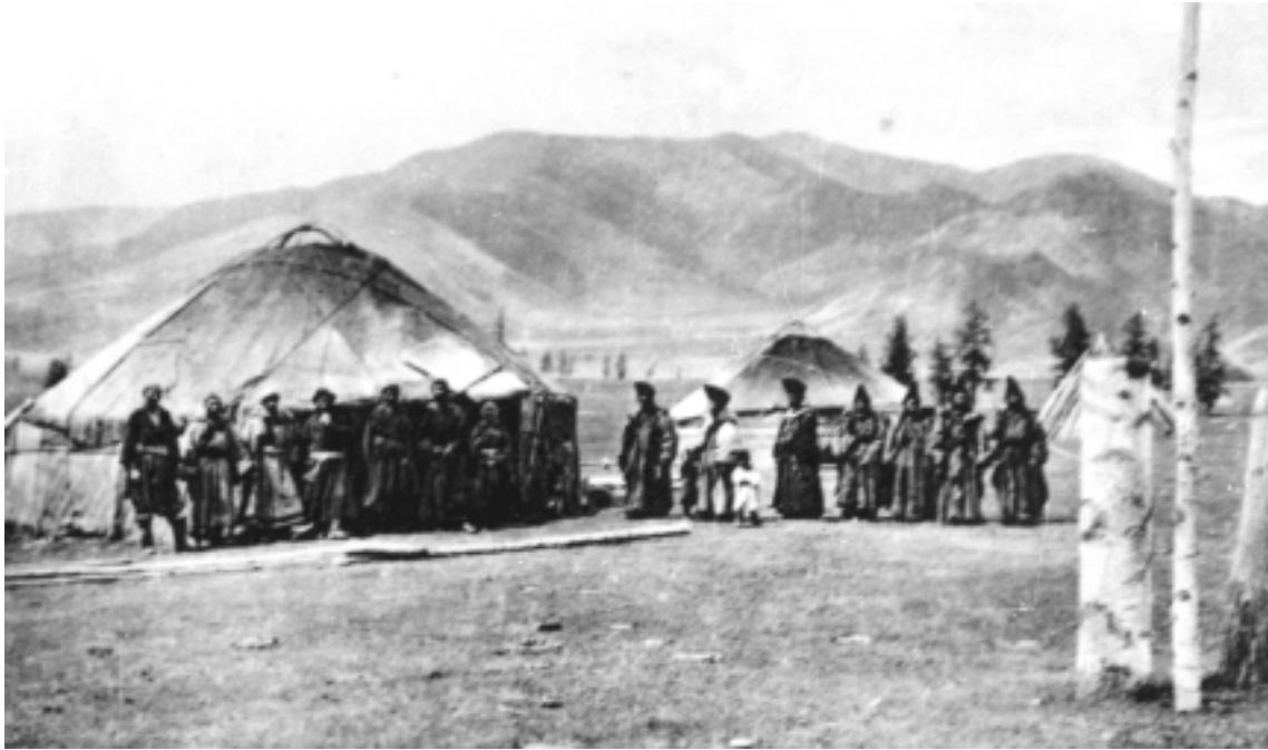
Fig. 9. A Burkhanist camp in the vicinity of the Karakol River (1908). An old Russian postcard from the personal collection of Yu.I. Ozheredov.

and shamanistic artifacts. Proponents of the “white faith” chased away shamans and burned their drums, other ritual outfits, and the skins of sacrificed animals.