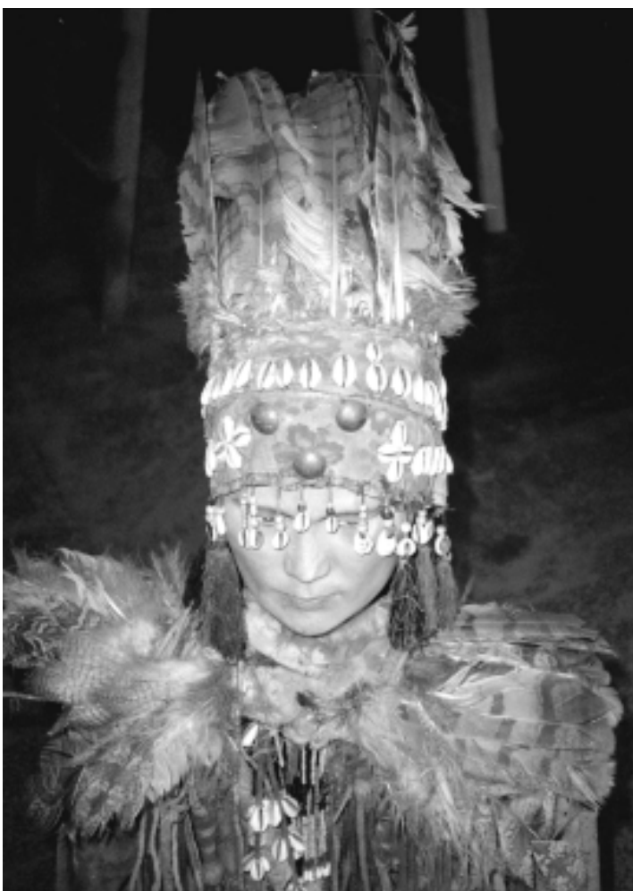
Fig. 3. Attire of the Altaian shaman, c. 1920s. Biisk Local Museum exhibit, photograph by the author.

In the second half of the eighteenth century, after their admission to the Russian empire, the Altaians found themselves at relative peace and even saw economic prosperity. In the mountain Altai, Russian authorities reserved for them a loosely defined territory of about 77,000 square miles, which was