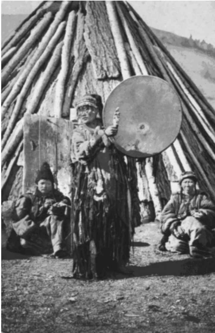
Fig. 2. An Altaian shamaness. Photograph by S.I. Borisov (1908); an old Russian color postcard from author's personal collection.

When Russia integrated the southern Altaian tribes as new subjects, it admitted them along with the remnants of their "Oirat" administrative system, which included tributary units named duchins and traditional leaders called zaisans . In early modern times, all Altaians were separated in kin-related communities that traced their origin to specific half-mythological ancestors. Yet in the nineteenth century, this structure began to disintegrate. At this time, society of the mountain Altai represented a collection of nomadic camps ( ails ) that included representatives of different clans. Ideologically, native communities in the Altai were shamanists despite their long-time interactions with the Oirat state, which had embraced and forcefully promoted Tibetan Buddhism (Lamaism) since 1616. The chief trait that places shamanism aside from so-