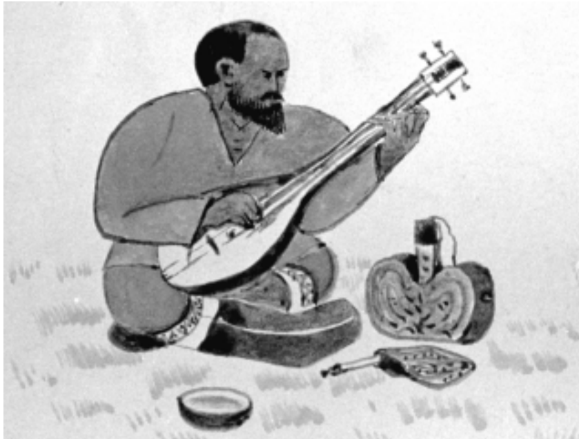
Fig. 5. Altaian storyteller ( kaichi ) playing traditional musical instrument topshur . Drawing by K. Maksimov (c. 1920s), Andrei Danilin Papers, Archive of St. Petersburg Museum of Ethnography (Künstkamera), f. 15, op. 1, ed. khr. 26.

with few exceptions, epic characters did not duplicate the shamanic pantheon. 23 Altaian epic tales and songs mostly deal with the deeds of mighty legendary heroes (Oirok-Khan, Amyr-Sana, and Shunu), gods (Uch-Kurbustan, Tengere, Erlik, Burkhan) or warriors known under different names. These stories are also full of references to the native land, which is described as wonderful “golden Altai” with an eternal summer. 24 Epic storytelling traditionally encompassed evenings, especially in summer when people had more leisure time, or complemented such events as long journeys and hunting expeditions. Special storytellers, called kaichi , recited many epic tales in the form of guttural songs.