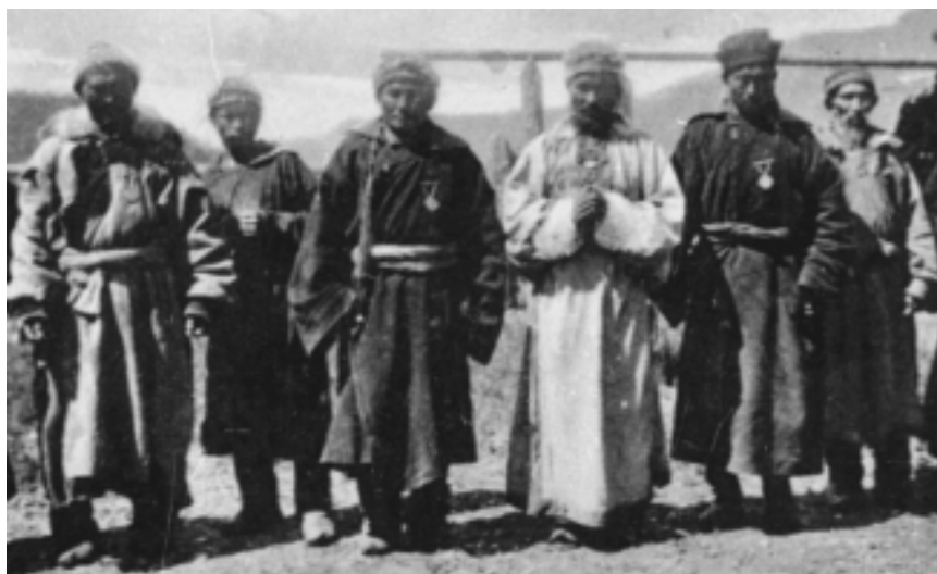
Fig. 7: A group of Burkhanists with their preacher dressed in a white robe (1908). An old Russian postcard from the personal collection of Yu.I. Ozheredov.

mass of people that is capable of withstanding outside influences." 32 The Oirot prophesy became what Armstrong calls mythomoteur , 33 the spiritual