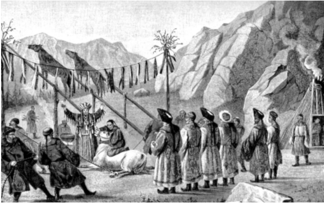
Fig. 4. Ritual animal sacrifice during a shamanic séance, the practice that repulsed Chet and his followers. A drawing from the Russian illustrated magazine Niva (1904).

It was not only the threat of land dispossession that concerned the nomads. In 1880, with the general modernization drive in the empire and at the insistence of missionaries, officials issued a circulation that prescribed Altaian natives to switch from the system of hereditary leadership to the election of their chiefs. What the native population feared most of all was that the land and administrative reform might bring them from the category of the nomadic tributary natives to the rank of peasants, which would mean greater financial burdens and participation in the military draft. 20 In the mountain Altai popu-