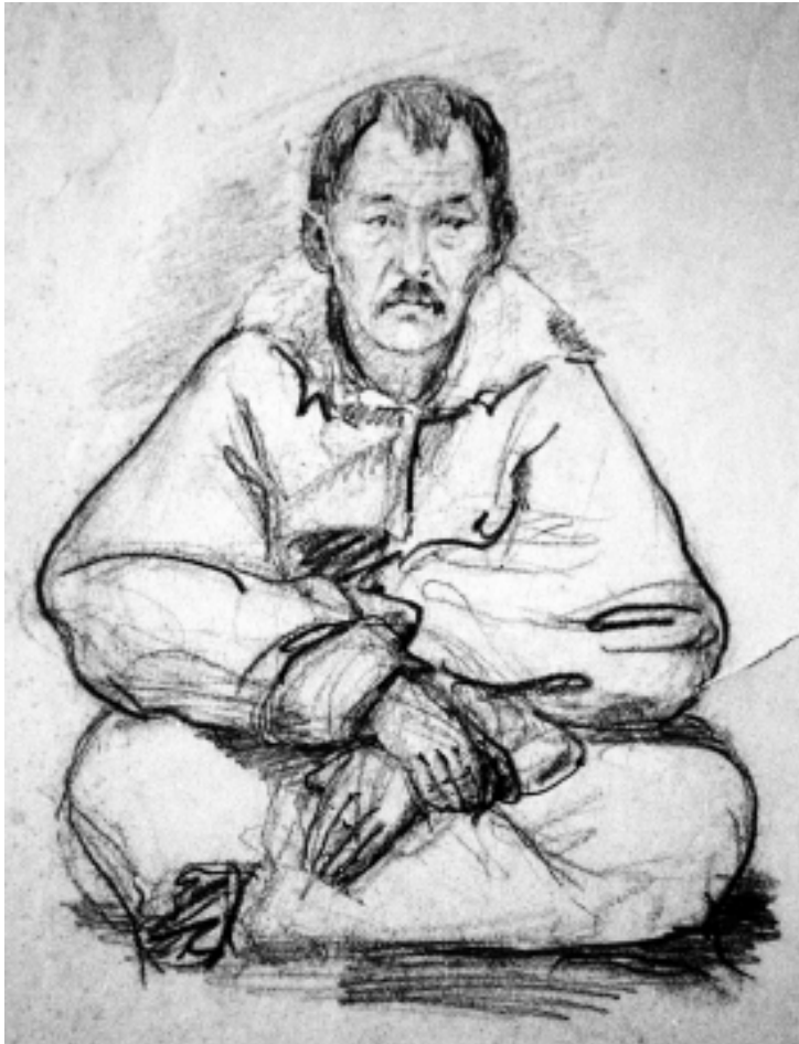
Fig. 1. Chet Chelpan, the founder of Burkhanism (White Faith) (1914).

Yet for the local officials the incident became a large headache. The expectation of the messiah by the natives and the movement it stirred scared the local Russian population and disrupted the routine cycle of provincial life. 4 What surprised and terrified the settlers, missionaries and officials was that so many natives in such a short span of time had suddenly stopped behaving as “normal savages,” banned their old shamanic ideology, and eagerly embraced the new prophecy. To put an end to this disarray, on Starinkevich’s orders, a group of more than 1,000 Russian peasant volunteers and loyal natives headed by