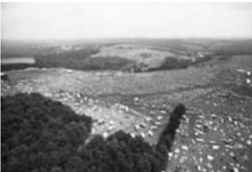
1969 aerial view looking southeast – main field is in the center; Best Road Campground is the rectangular area straight ahead; Filippini Pond on the far left