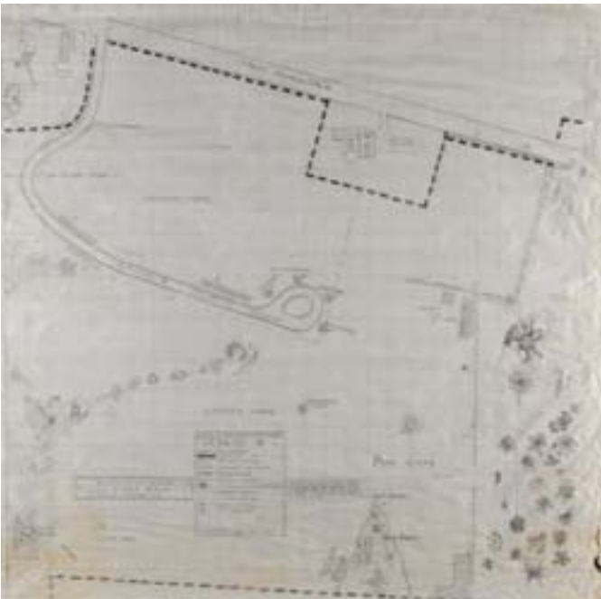
Hog Farm and Camping Area