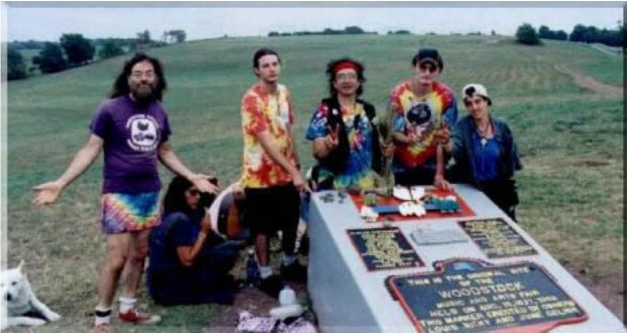
Woodstock Monument with visitors