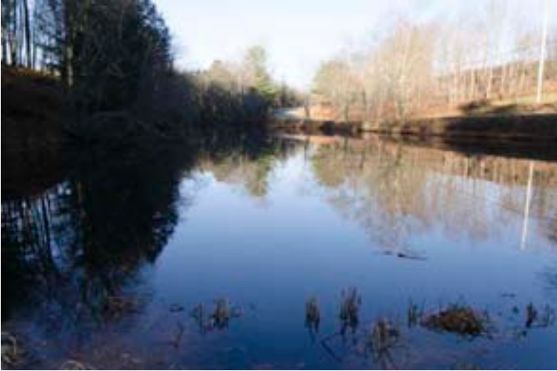
West Shore Road Stream and Dam