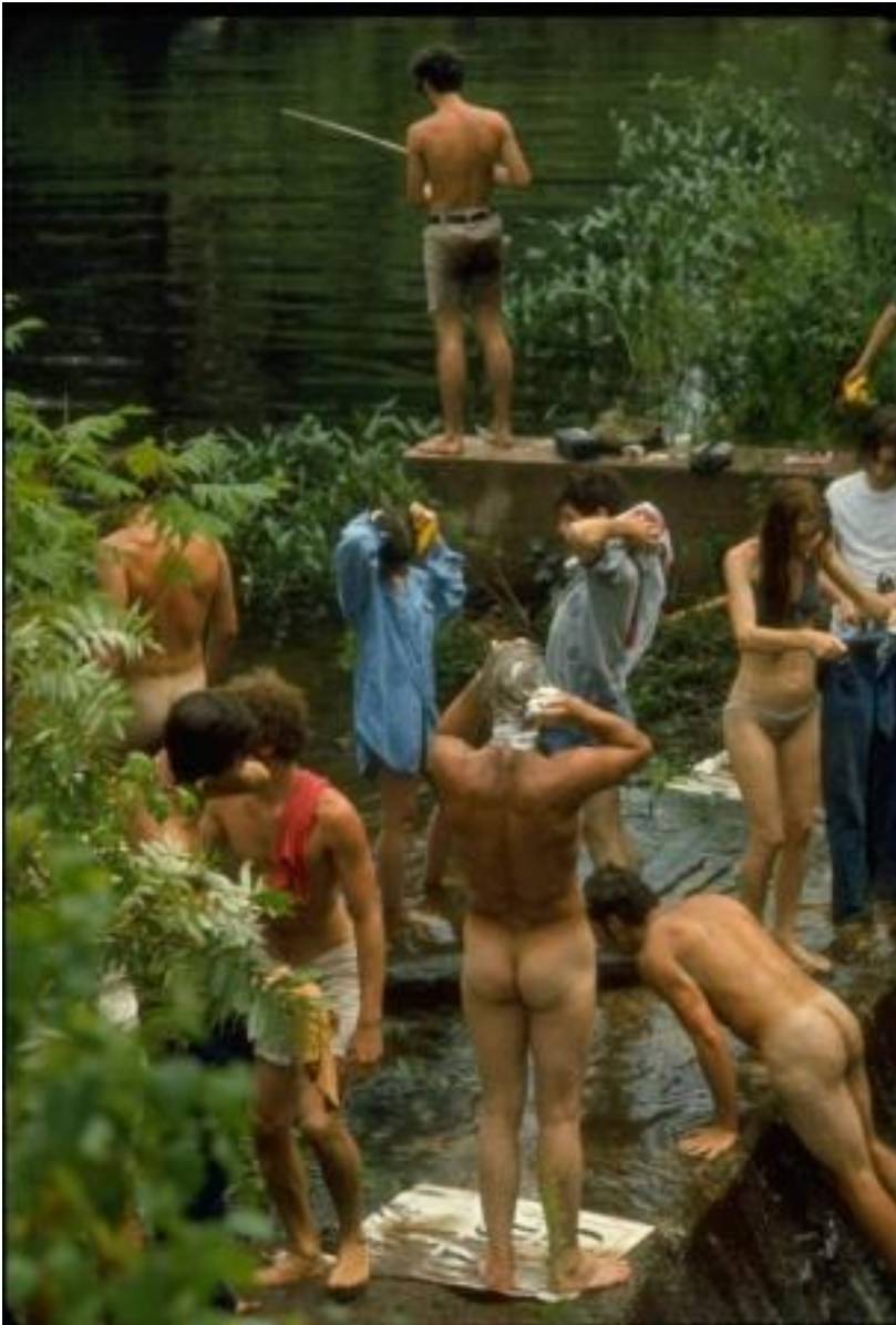
1969 – West Shore Road Stream and Dam