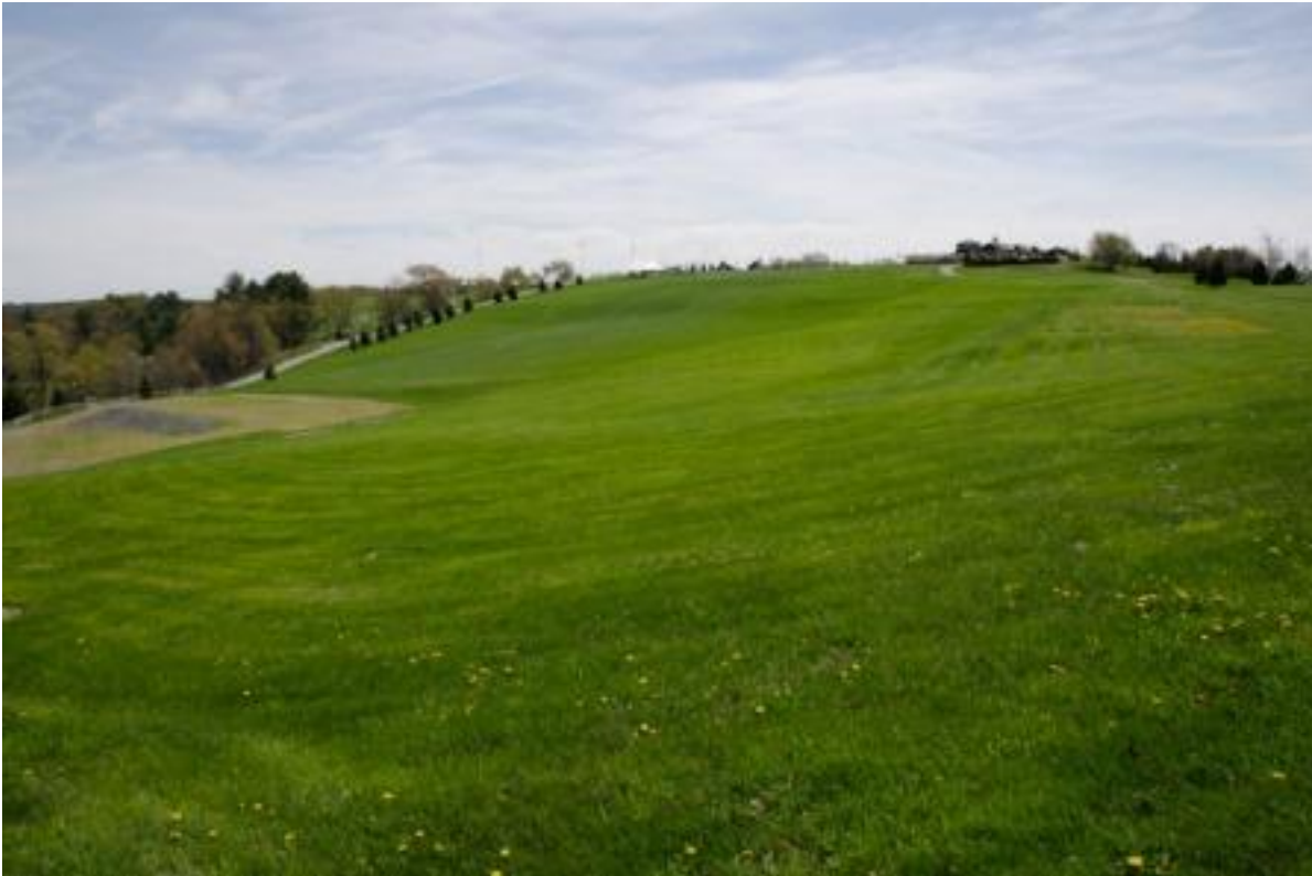
Main Field looking southeast – stage would have been to the left of the raised pad