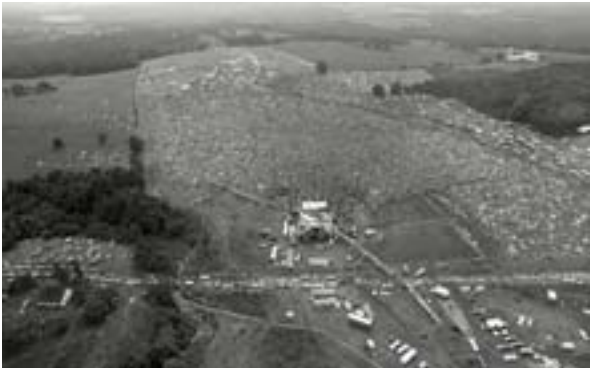
1969 aerial view looking south over stage at main field