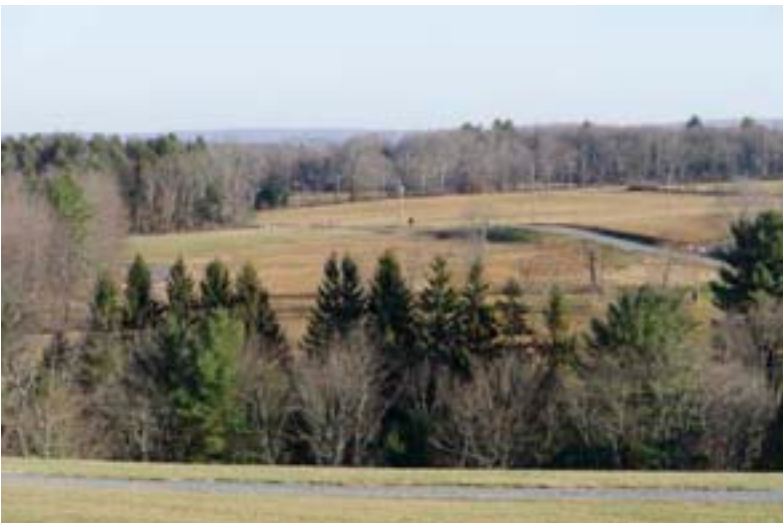
Best Road Campground