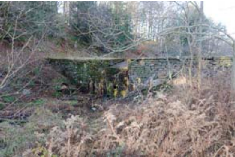
West Shore Road Dam