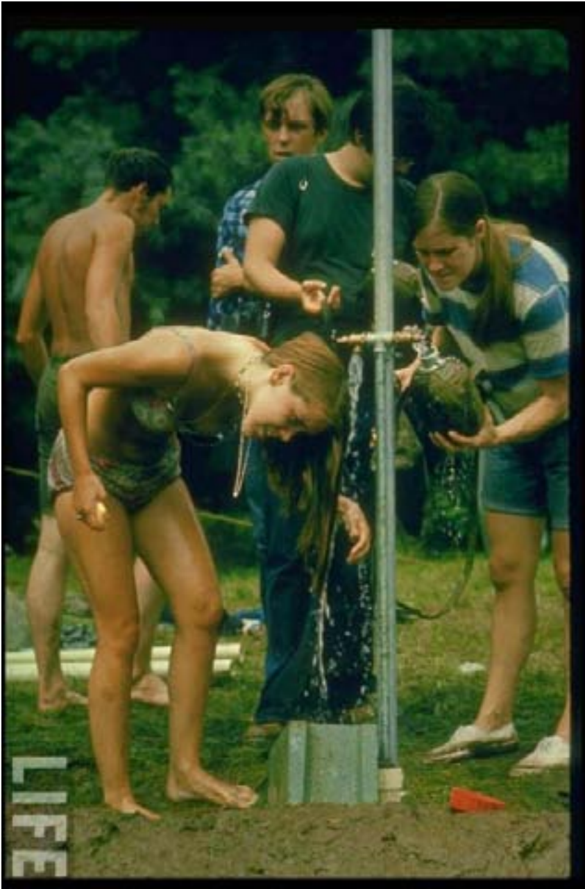
1969 – Water Distribution System