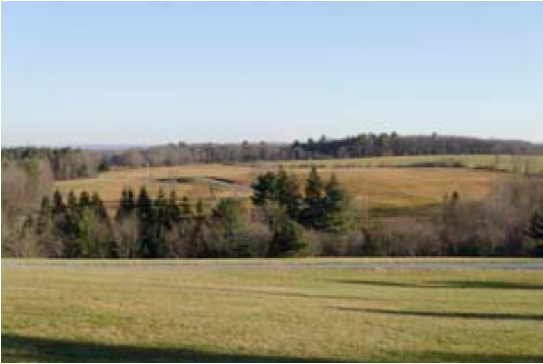
Best Road Campground