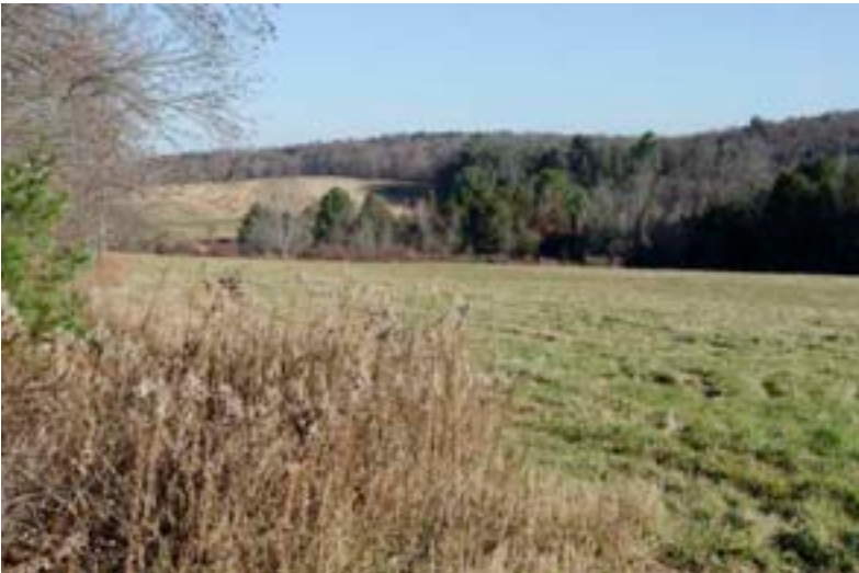
Perry Road Camp Ground