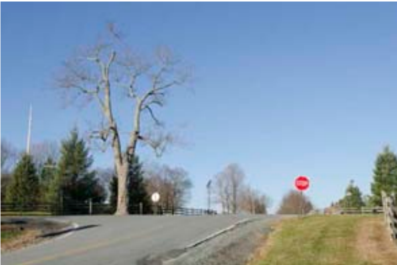
Information Tree, corner of West Shore and