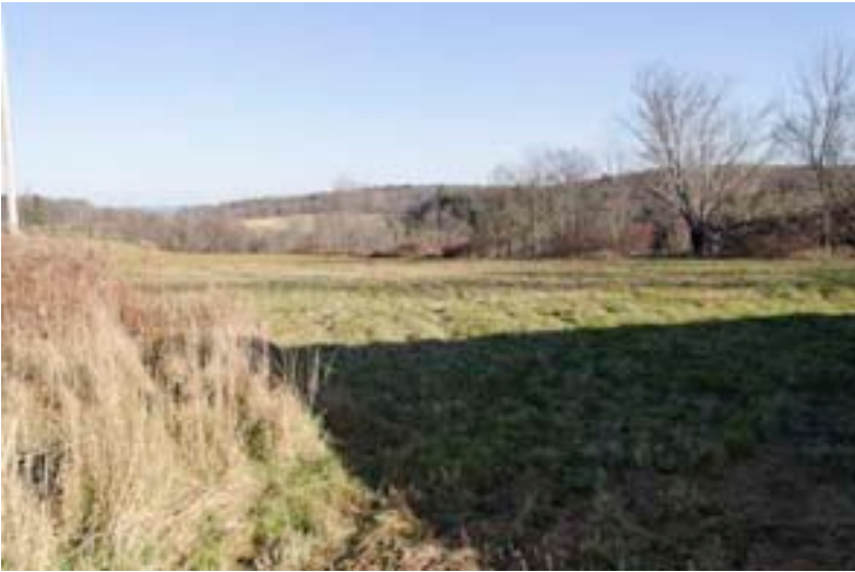
Perry Road Campground