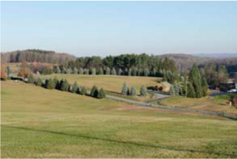
Performers' Area to the right; heliport area to the left, across. Looking north, across West Shore Road