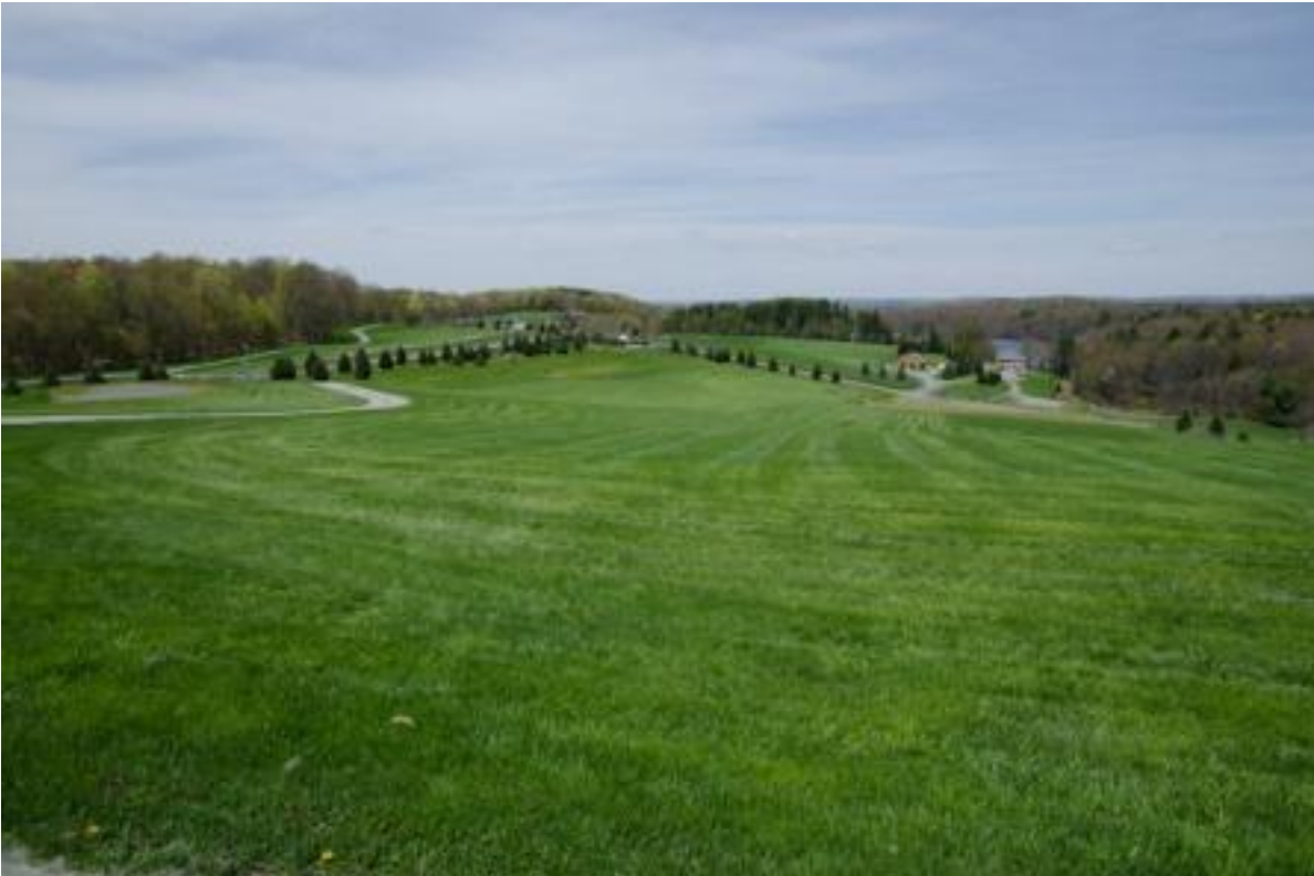
Main field, looking north toward stage location; Filippini Pond in the distance; Bindy Woods to the left