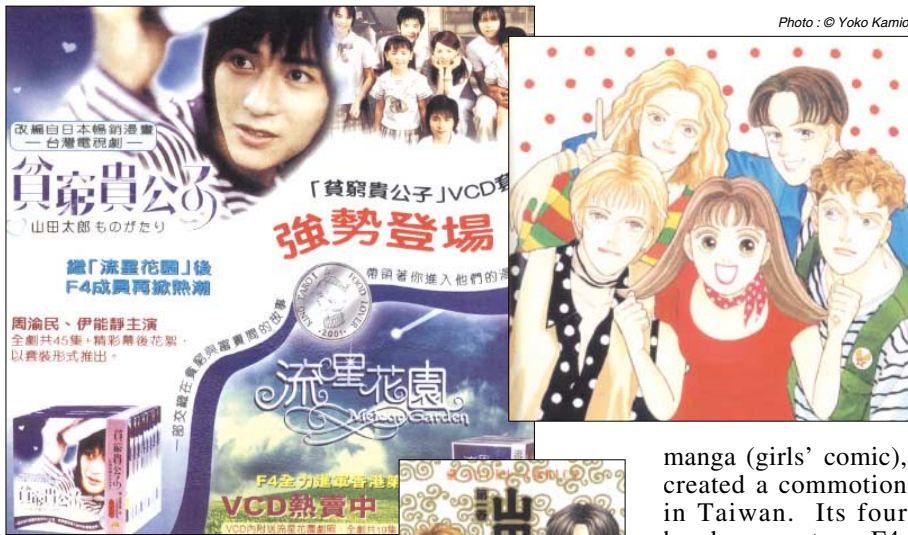
Hana yori dango and Yamada Taro mongatari were adapted into popular Taiwanese television drama serials.

ground when people are surprised, have become clichés in Hong Kong comedies.