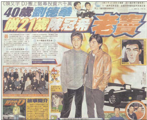
Initial D is being made into a Hong Kong live-action movie.

self-study, but also through on-site job training. Thousands of Chinese animators work for the Japanese in making Japanese animation in China. Under Japanese supervision and guidance, they are put in charge of uncreative and labor-intensive jobs, such as drawing the details and background, coloring and digitalizing. Nowadays, the majority of Japanese television cartoons and animated films are partially made in China to cut production cost. Chinese animators are learning from the Japanese through this kind of "division of labor" in animation production.