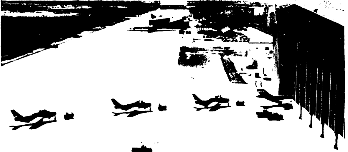
The flight line in 1955 was a beehive of activity as hangars were moved from the old South Base to the new Main Base area. One of the hangars became the maintenance hangar for school aircraft.